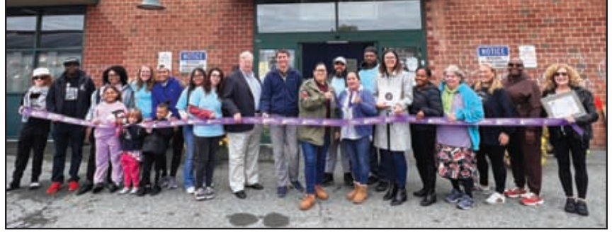
718 Broadway, Kingston, NY thebroadwaybubble.com