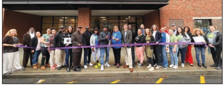
16 Cedar Street, Kingston, NY cce4me.org