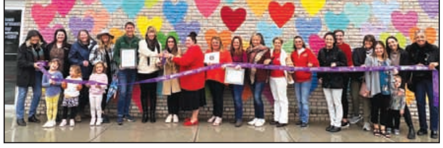
775 Broadway, Kingston, NY