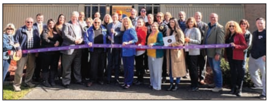
144-D Pine Street, Kingston, NY www.normannstaffing.com