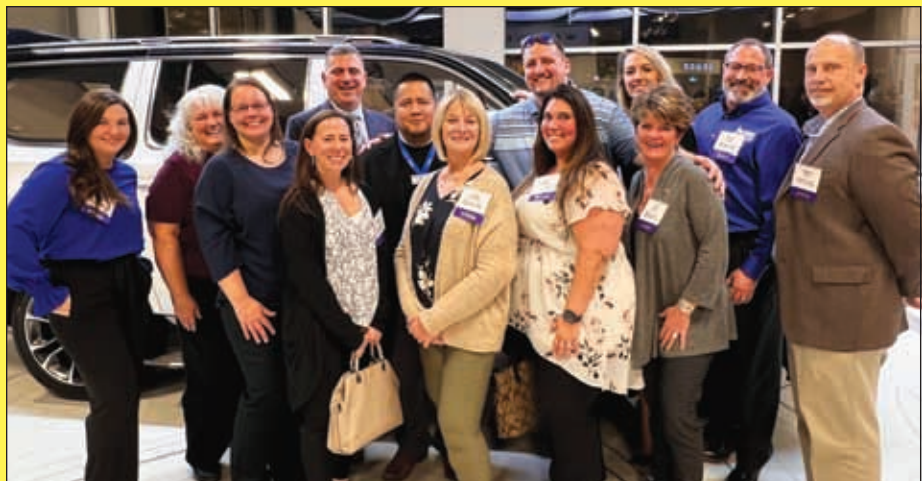
Our Mixer Sponsor, Mid-Hudson Valley Federal Credit Union.