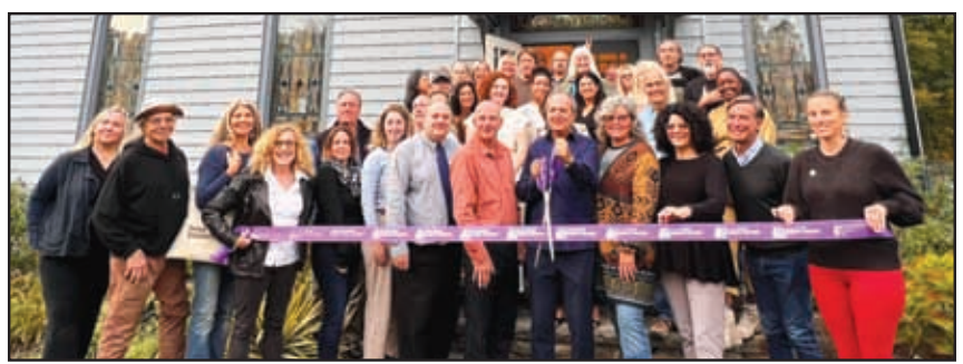
1360 NY-28, West Hurley, NY radiowoodstock.com