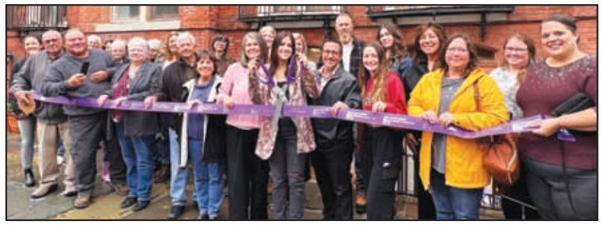
25 John Street, Kingston, NY remedyskinstudio.square.site