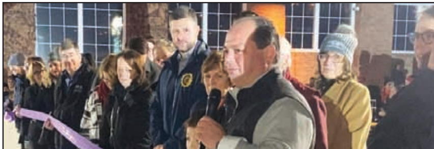
100 Rondout Landing Kingston NY olesavannah.com