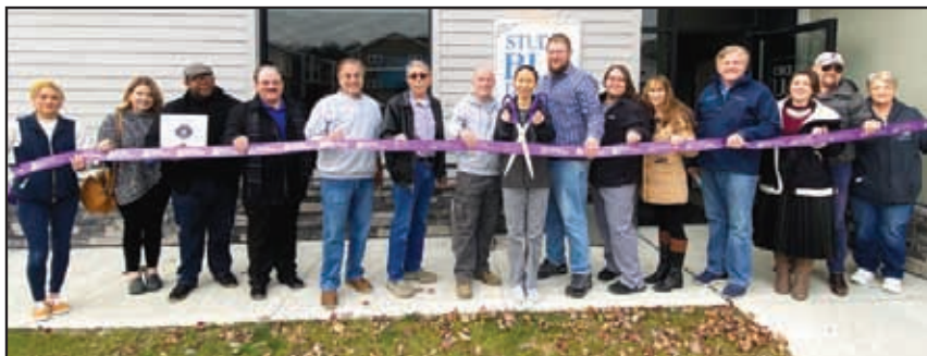
3590 Route 9W, Highland, NY www.studiobludental.com