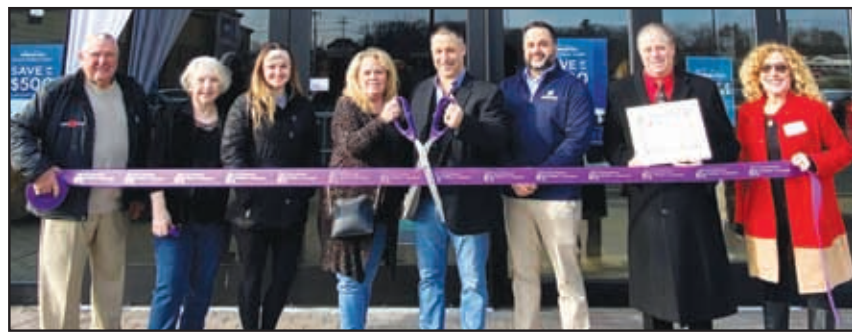
1153 Ulster Avenue, Kingston, NY sleepandspas.com