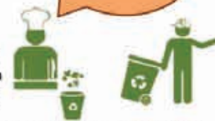
Food Waste Prevention and Recovery Act

Did you hear about the new composting law in Ulster County?