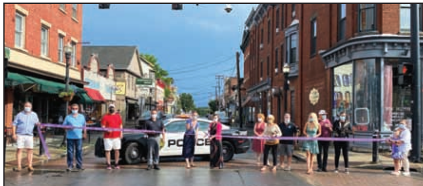
340 Main St., Saugerties, NY destinationsaugerties.org