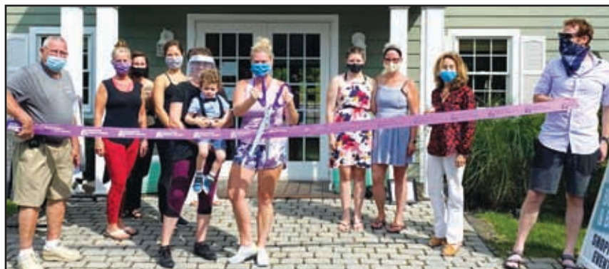
1754 Old Kings Highway/Lazy Swan, Saugerties, NY bodybewellpilates.com