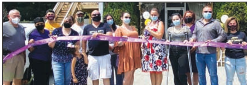
3761 Rt. 9W, Highland, NY lillyraeinthehamlet.com