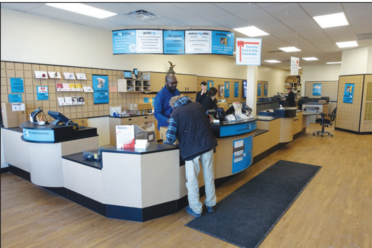
Continued from page 6

businesses who are here and what they offer. You also get new people coming into the area who can learn what your business does. We've been here for 16 years and we still surprise people with what we can do for them."