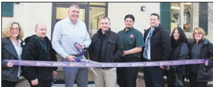
236 Plaza Rd. (Kingston Plaza), Kingston, NY www.hrt.bz

Ulster County Regional Chamber of Commerce