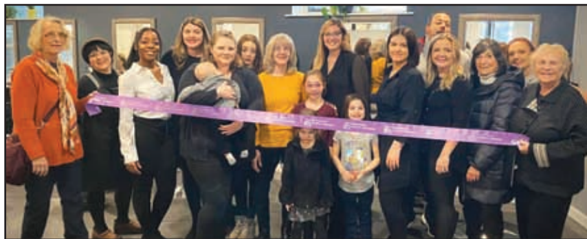
10 Abeel Street, Kingston, NY www.artisanbeautyNY.com