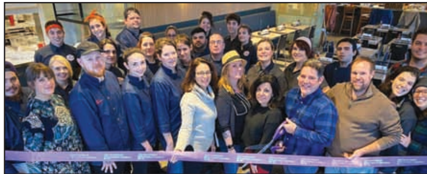
261 Tinker Street, Woodstock, NY www.dixonroadside.com