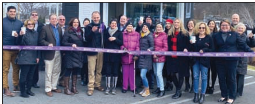
1571 Ulster Avenue, Town of Ulster, NY www.allthatjava.net