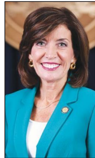
Continued on page 9 NYS Lt. Gov. Kathy Hochul

"When this governor came into office, he recognized