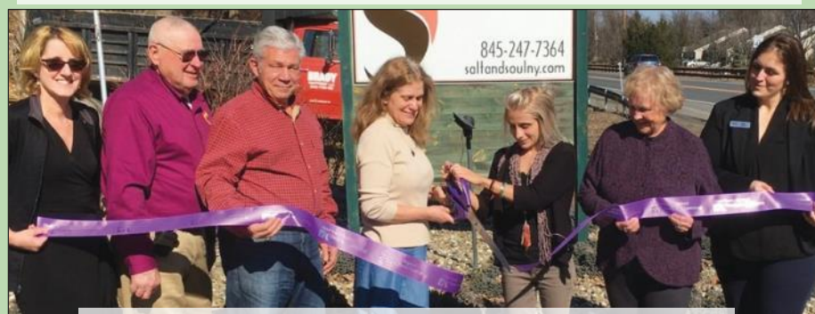
SALT & SOUL: 2917 Route 9W, Saugerties, NY • www.saltandsoulNY.com