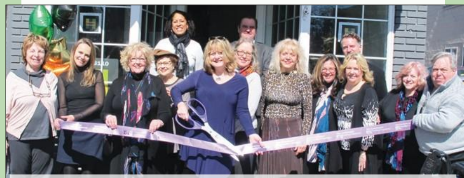
HALTER ASSOCIATES REALTY: 89 North Front Street, Kingston, NY • www.halterassociatesrealty.com