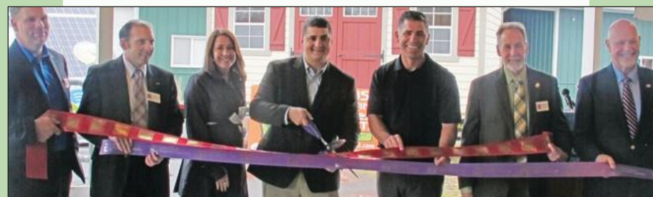
TINY HOUSE FREEDOM FEST: 4502 Commercial Drive, New Hartford, NY • www.tinyhousefreedomfest.com