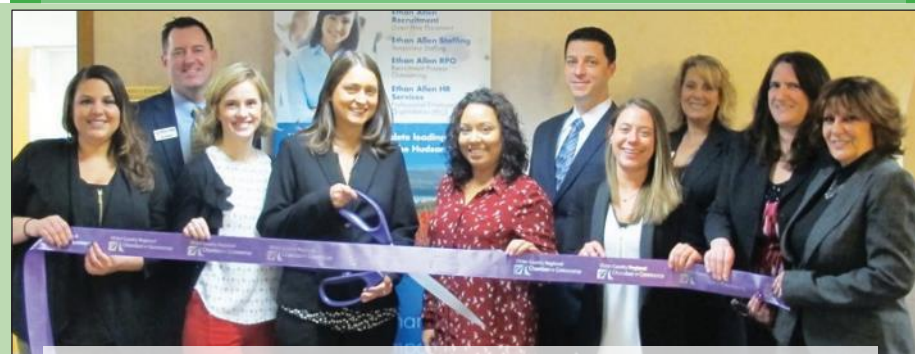
ETHAN ALLEN WORKFORCE SOLUTIONS: 660 Aaron Court, Suite 660, Kingston, NY • www.eaworkforce.com