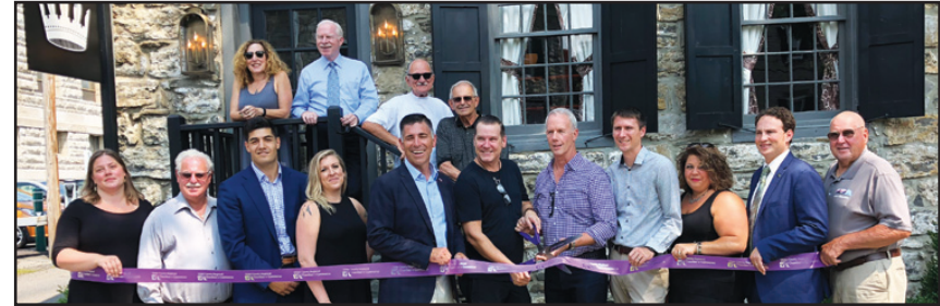
10 Crown Street, Kingston, NY www.10crownstreet.com