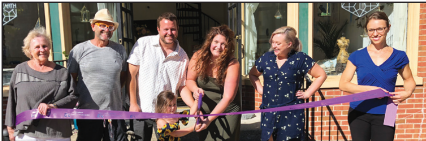
22 Broadway, Kingston, NY facetsofearth.com