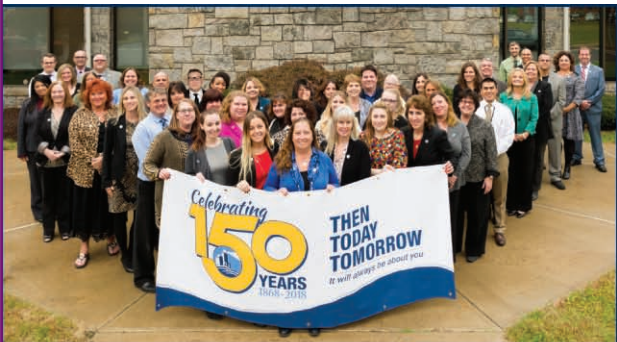
Thank you for your support as we celebrate 150 years of being your community bank.

single-payer health care system and cutting military spending among his proposals. “They would include concrete proposals to provide a literate, critically thinking workforce at blue and white collar levels, and assure the hospitality and agricultural industries a secure workforce,” he said. The 19th District includes all of Ulster, Greene, Columbia, Sullivan, Delaware, Schoharie and Otsego counties and parts of Dutchess, Rensselaer, Montgomery and Broome counties. Chamber breakfast programs are a great way to network with other local business leaders and stay on top of current events. Pre-registration is strongly encouraged. For more information or to register, call the Chamber at (845) 338-5100 or go online at www.ulsterchamber.org .