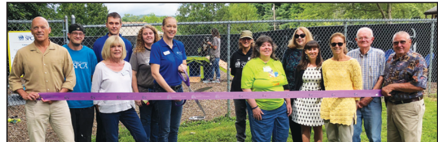
20 Wiedy Road, Kingston, NY www.ucspca.org