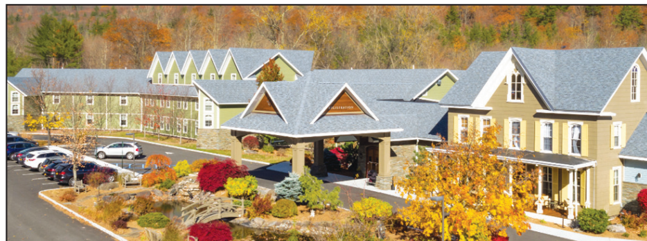
2017 Business of the Year – Emerson Resort and Spa