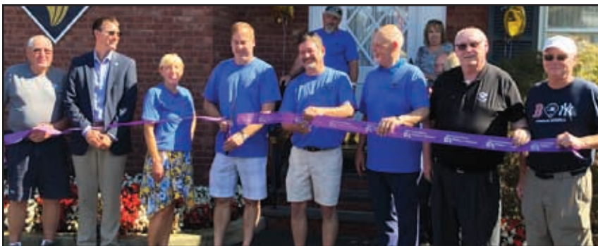
411 Albany Avenue, Kingston, NY 12401 www.simpsongaus.com