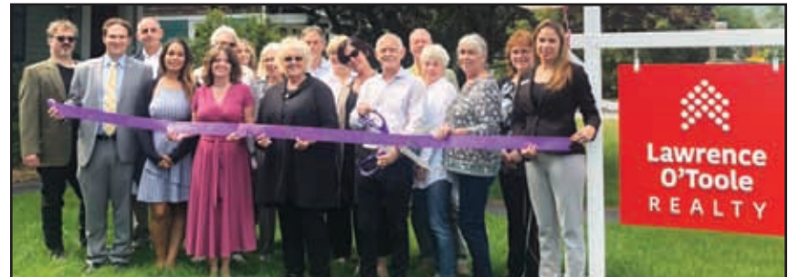
76 Mill Hill Road, Woodstock, NY www.LawrenceOTooleRealty.com