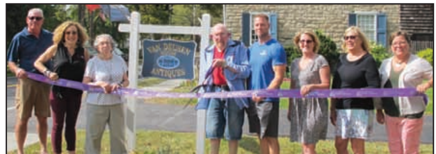
59 Main Street, Hurley, NY www.vandeusenhouse.com