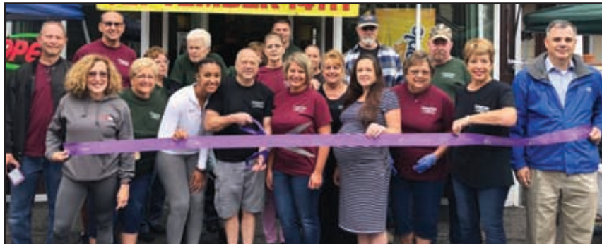
100 Foxhall Avenue, Kingston, NY Find us on Facebook