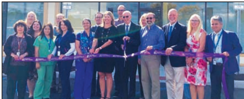
264 Main Street, New Paltz, NY www.caremountmedical.com