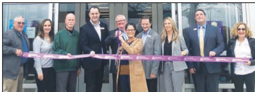
401 Frank Sottile Blvd., Kingston (Town of Ulster), NY www.raymourflanigan.com