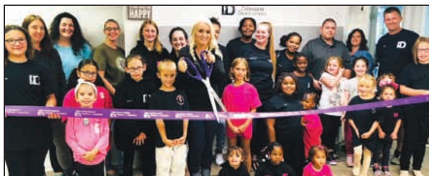
169 Broadway, Kingston, NY www.illusiondancenyc.com