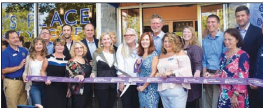
779 Broadway, Kingston, NY www.peoplesplaceuc.com