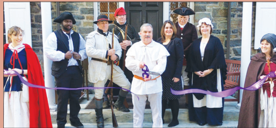
FRIENDS OF THE SENATE HOUSE: 296 Fair Street, Kingston • www.senatehousekingston.org