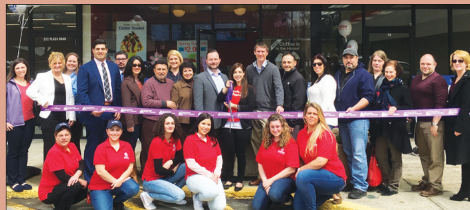
EDIBLE ARRANGEMENTS OF KINGSTON: 220 Plaza Road (Kingston Plaza), Kingston www.facebook.com/ediblearrangementsofkingston