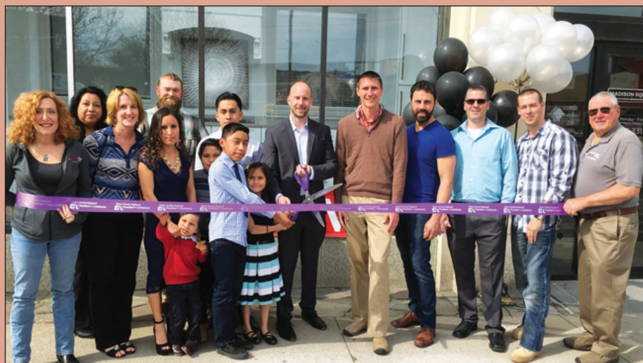
MADISON SQUARE DESIGN: 516 Broadway, Suite 2, Kingston • www.madisonsquaredesign.com