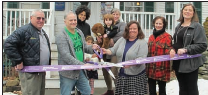
Papa Bear's Cafe, Route 209, Marbletown, NY www.thedenofmarbletown.com