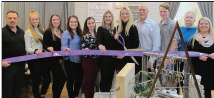
99 Partition Street, Saugerties, NY www.littleblueberry.com