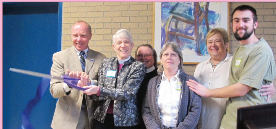
SUNY ULSTER FOOD PANTRY: 491 Cottekill Road, Stone Ridge, NY