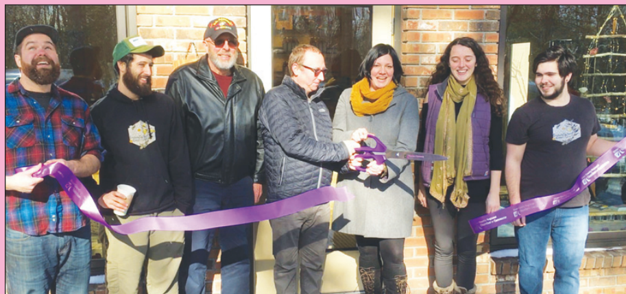
ImmuneSchein GINGER ELIXIRS: 43 Basin Road, West Hurley, NY