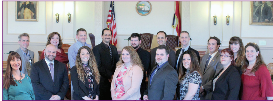
Leadership Ulster Class of 2018

The Ulster Leadership program began in 1992 and has stocked Ulster County's boards, non-profits and community organizations with almost 400 trained