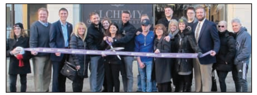
516 Broadway Suite 1, Kingston, NY www.AlchemyTotalWellness.com