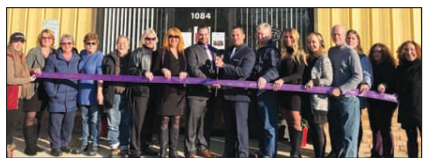
1084 Morton Blvd., Town of Ulster, NY www.amfit.net