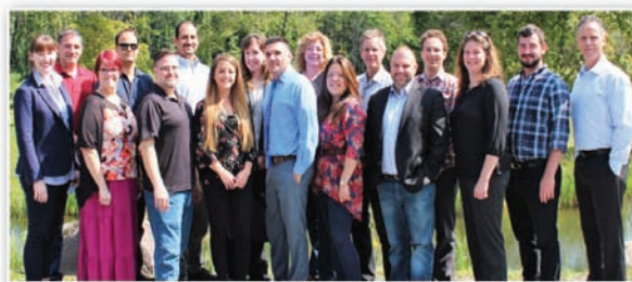
Leadership Ulster Class of 2018