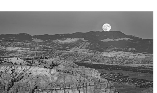
Tinted with colors too numerous and subtle to name, the whimsically arranged hoodoos of Bryce Canyon National Park create a wondrous landscape of mazes, offering some of the most exciting and memorable walks and hikes imaginable.