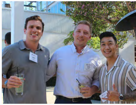
YPG 2022-23 Graduation