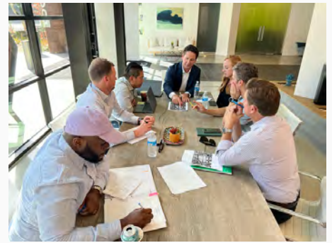
YPG team working on their Capstone Project