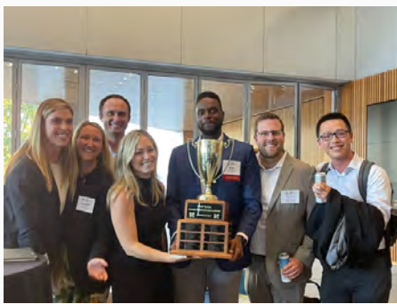
YPG 2022-2023 Case Competition Winners

The Young Professionals Group (YPG) is NAIOP SoCal's industry-leading professional development and leadership program. Each year, 35 real estate professionals are selected to take part in a 12-month, 70-hour course designed to educate, develop, connect and elevate the industry's emerging leaders. The program offers instruction on critical components of the industry, personal and professional development coaching from MBA-level instructors, extensive networking and relationship-building activities, and guidance from executives through an intimate speaker series.