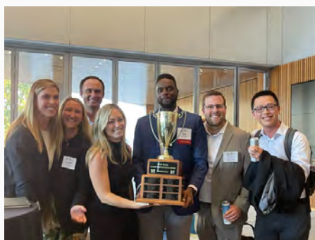
YPG 2022-2023 Case Competition Winners

The Young Professionals Group (YPG) is NAIOP SoCal's industry-leading professional development and leadership program. Each year, 35 real estate professionals are selected to take part in a 12-month, 70-hour course designed to educate, develop, connect and elevate the industry's emerging leaders. The program offers instruction on critical components of the industry, personal and professional development coaching from MBA-level instructors, extensive networking and relationship-building activities, and guidance from executives through an intimate speaker series.