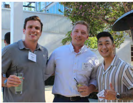
YPG 2022-23 Graduation