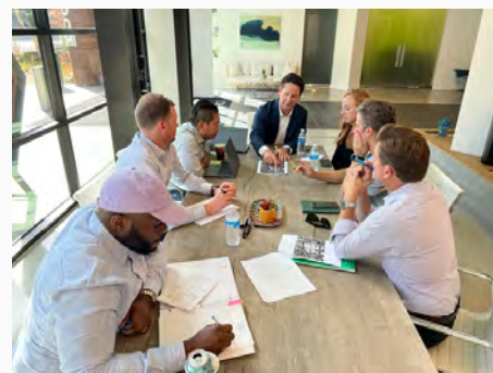
YPG team working on their Capstone Project