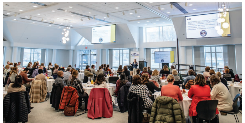
West Michigan HR Professionals attended our Employment Law Update at the Haworth Hotel in partnership with Miller Johnson and the Lakeshore Human Resource Management Association.