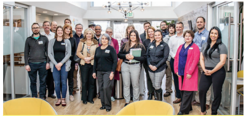
Dozens of Chamber members attended our Leading Edge Workshop: Skills for Bridging the Divide in partnership with Braver Angels and Boileau & Co. Attendees learned how to have respectful conversations with others, even when they disagree.