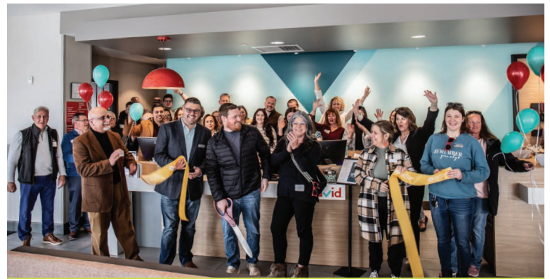
The team at 6PM Hospitality Partners purchased Avid Hotel in Zeeland. They held a ribbon cutting to celebrate alongside municipal leaders and community members.