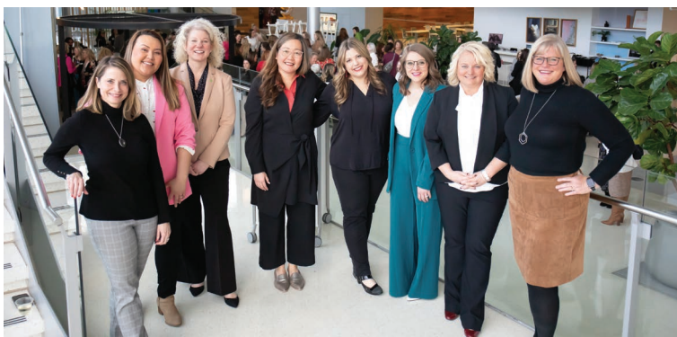
This year's Lakeshore Women Connect Honorees posed for a photo following the conclusion of the program during Lakeshore Women Connect at Haworth's Corporate Headquarters. Thank you to Lakeshore Advantage for partnering with us on this event.