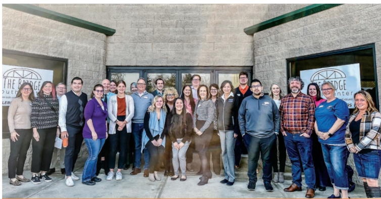
Our Ambassadors recently gathered at The Bridge Youth Center for their monthly meeting. Thank you to Blue Cross Blue Shield of Michigan for sponsoring our Ambassador Team.