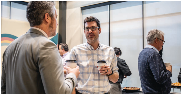
Engaged community members enjoyed networking during Social Hour with the Chamber at Gateway Spoon. Thank you to Gateway Spoon for supplying complimentary breakfast bites and coffee.