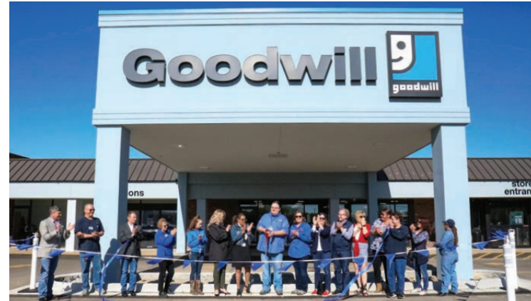
Ribbon Cutting at Goodwill, celebrating their new southside Holland store location.