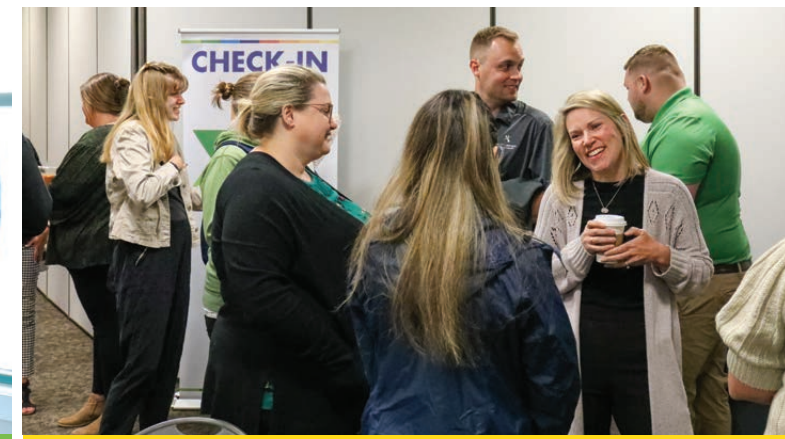
ZAG is Back! After 2 years, Chamber Members gathered again for our Zeeland Affinity Group meeting.

this exciting growth, human resources has been holding internal and external job fairs to find more bilingual leaders to join the manufacturing team. If you are interested in a bilingual position at Gentex, please check out its careers page to apply.