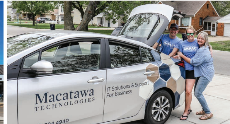
Did you know that Macatawa Technologies closed down their office to participate in Community Impact Day 2022?!