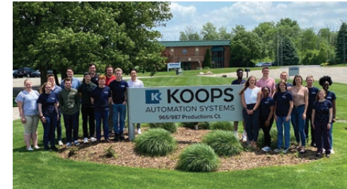
Koops Automation Systems 2022 Summer Co-Ops and Interns

It has been a real privilege to collaborate with an outstanding team at Koops over the last 25 years. In that time one of the rewarding activities that we have been able to conduct was transitioning the organization to an employee-owned company. We are coming up on our 10-year anniversary and looking forward to the next 10 years.