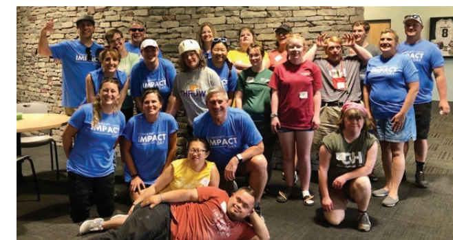
Creative Dining volunteered at Compassionate Heart Ministries