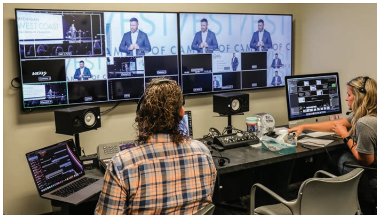
Backstage for Leadership Live at Engedi Church – where the magic happens!