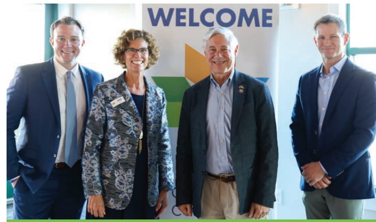
Congressman Upton celebrating his last West Coast Chamber Advocacy in Action program of his longtime career.