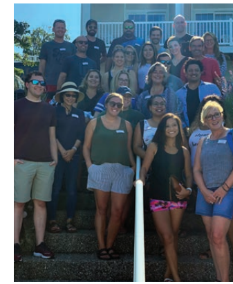
WCL Class of 2022