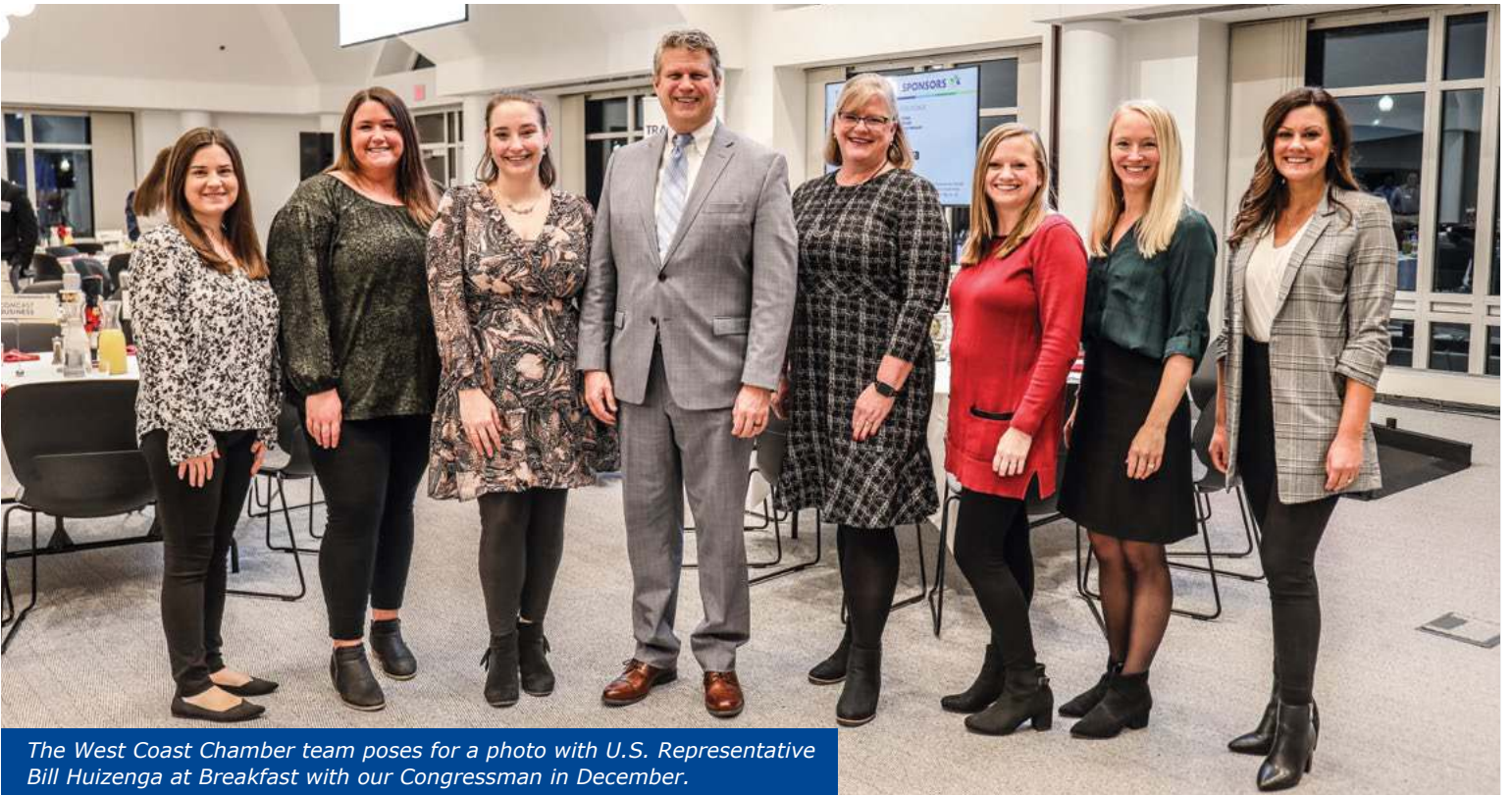
The West Coast Chamber team poses for a photo with U.S. Representative Bill Huizenga at Breakfast with our Congressman in December.