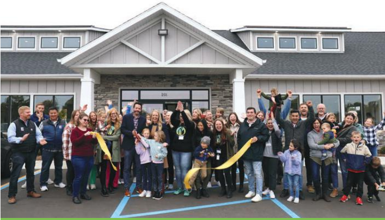
Ribbon cutting celebrating Hope Discovery ABA Services' new facility in Zeeland