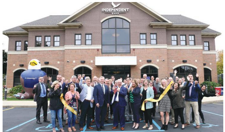
Ribbon cutting celebrating Independent Bank's new branch in Holland