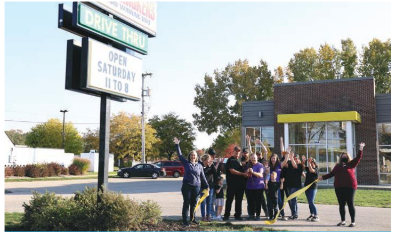
Ribbon cutting celebrating Holy Smokers BBQ's new brick and mortar location in Holland