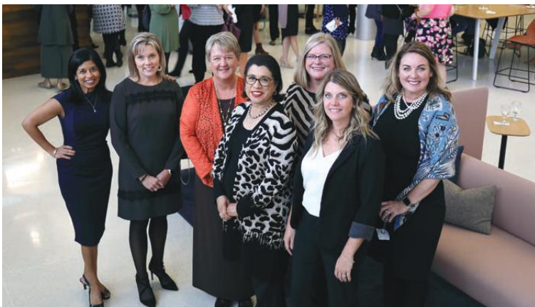
Our 2022 Lakeshore Women Connect honorees pose for a photo at the Lakeshore Women Connect event