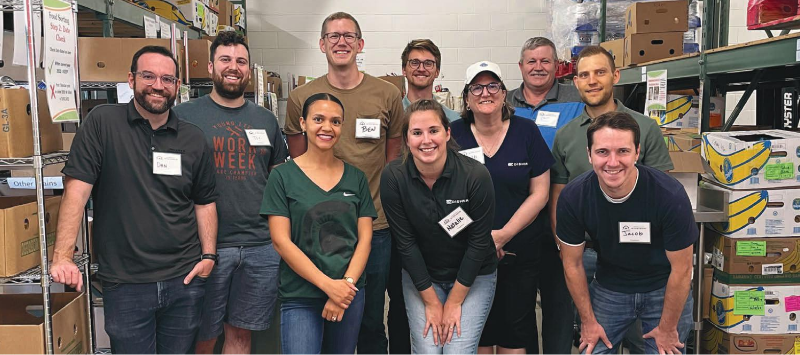
Community Action House Stewardship

team members and 32% being DEN — DISHER Extended Network team members), and over five solution areas (engineering, product development, manufacturing tech, talent recruitment, and business consulting).