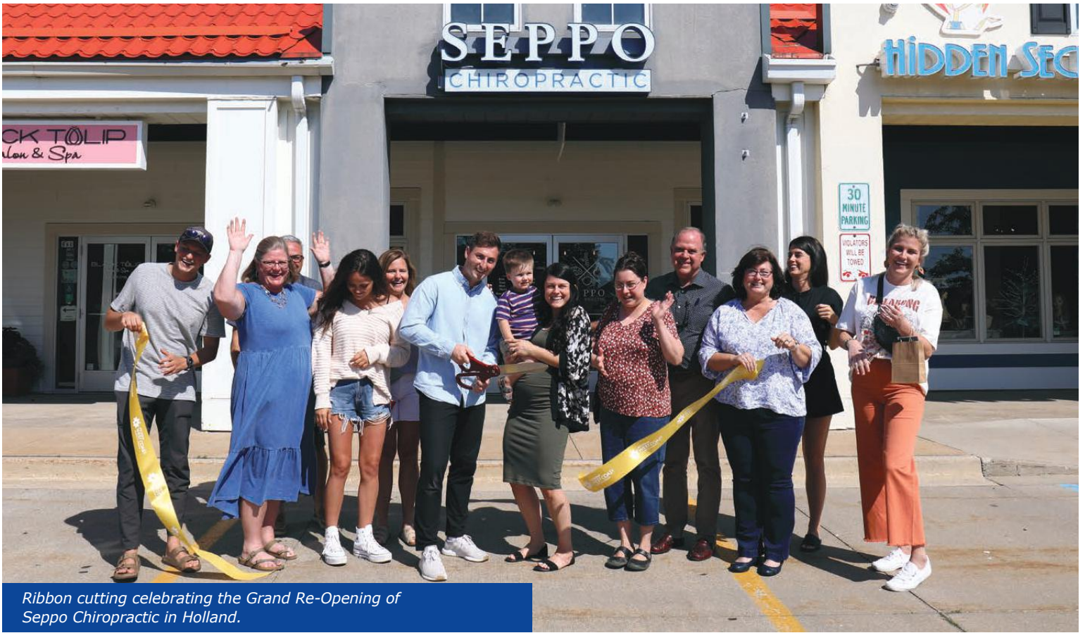
Ribbon cutting celebrating the Grand Re-Opening of Seppo Chiropractic in Holland.