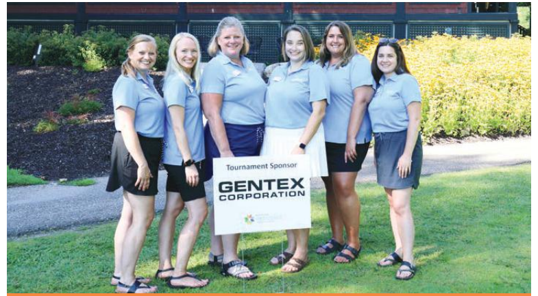
The Chamber team celebrates a successful golf outing at the Ravines in Saugatuck.