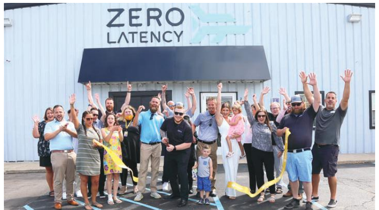
Ribbon cutting celebrating the Grand Opening of Zero Latency in Holland.