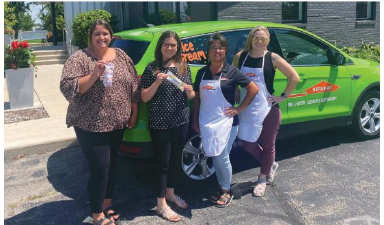
The Chamber team enjoys ice cream generously provided by SERVPRO of Holland.