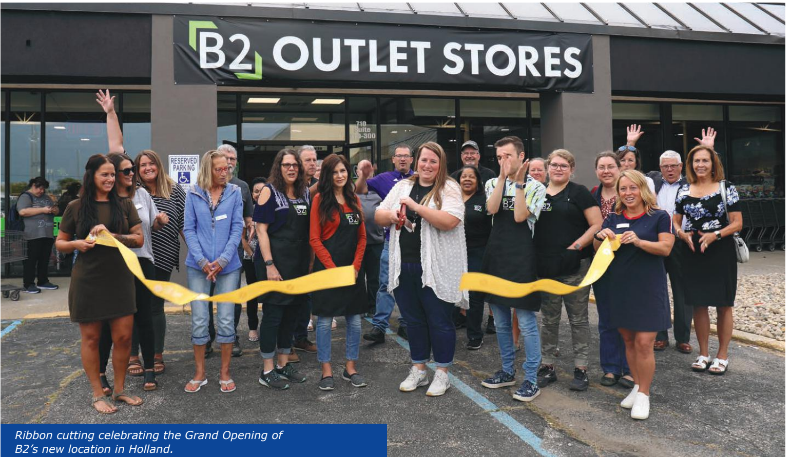
Ribbon cutting celebrating the Grand Opening of B2's new location in Holland.