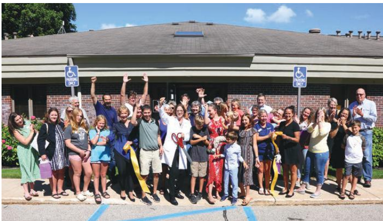
Ribbon cutting celebrating the Grand Opening of Joy Family Health in Holland.