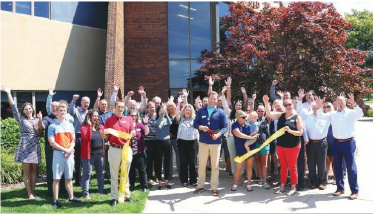
Ribbon cutting celebrating Grand Opening of Hungerford Nichols' new office in Holland.