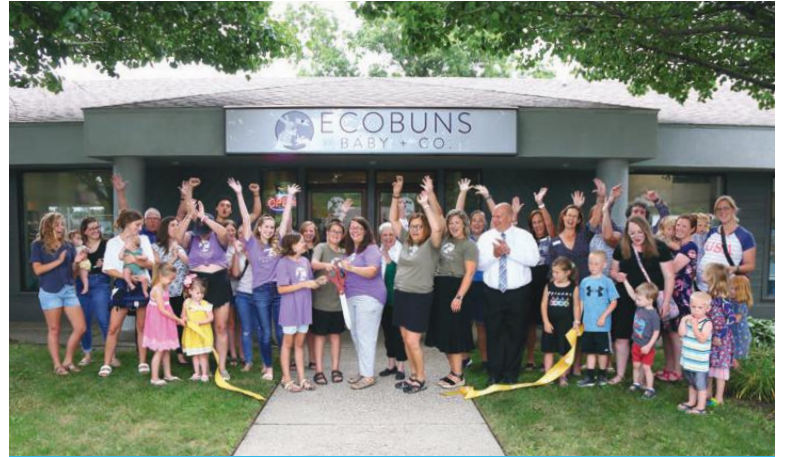
Ribbon cutting celebrating the Grand Opening of EcoBuns' new location in Holland.