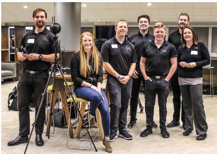
The team from 730 Eddy Studios brought AR to life at our February WUWC breakfast.