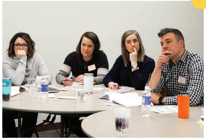
Our West Coast Leadership class participates in a simulated society to better understand the difficulties that can come out of governing a society.