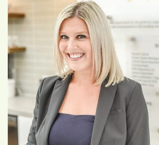
Alexa Redick Children's Advocacy Center

To me, leadership does not have to be your boss. It's somebody who wants to help, grow, coach, it's a person who walks the walk. Honest, respectful, listens.