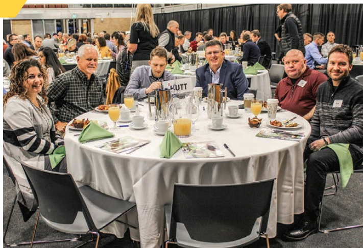
Team members from Hutt Trucking having fun at WUWC Breakfast.