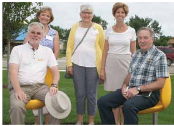
Meeting the judges from Communities in Bloom