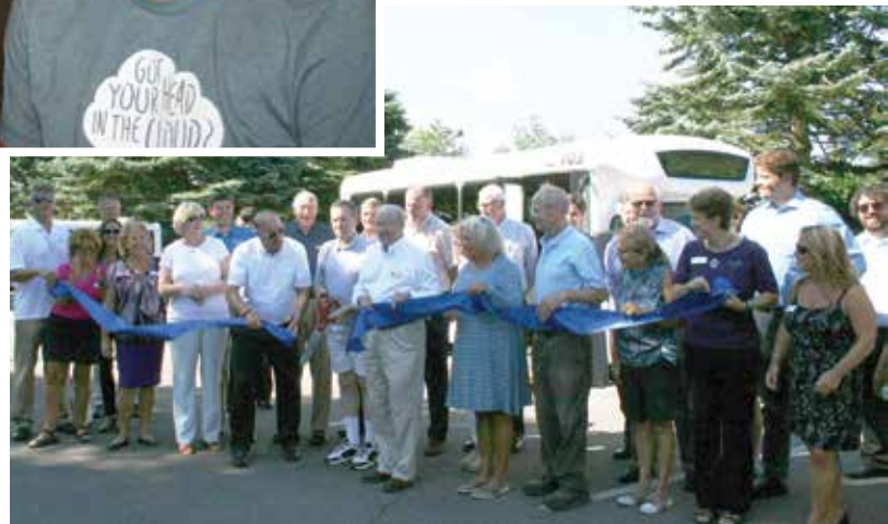
Ribbon Cutting for Max Bus in Park Township