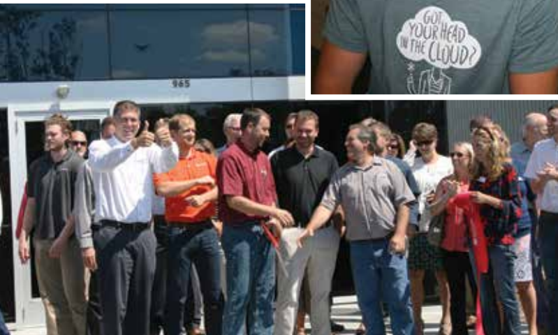
Ribbon Cutting at Koops