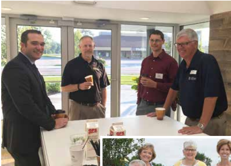
July summer coffee