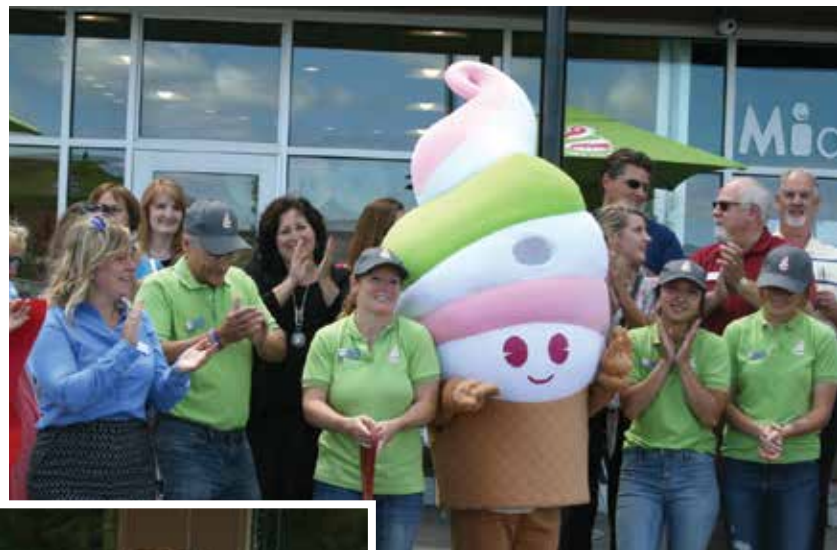
Menchie's Frozen Yogurt Ribbon Cutting