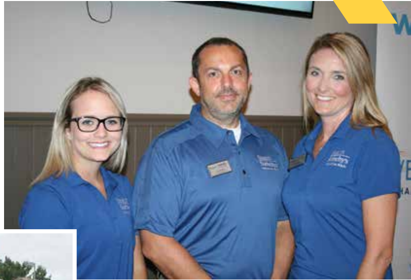
The Beacon Sotheby's team