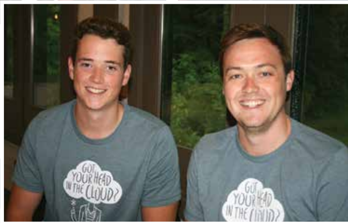
Worksighted interns at the Golf Outing