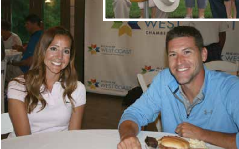
Lunch at the Golf Outing