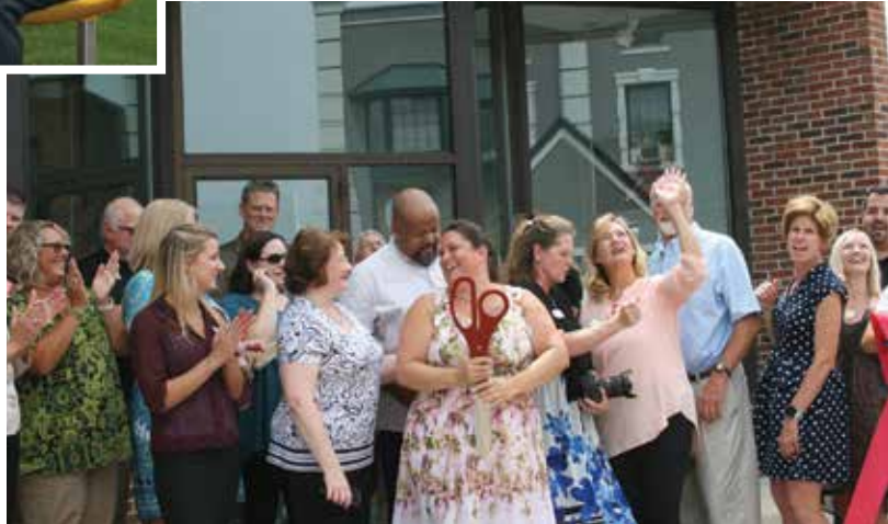
Ribbon Cutting at deVries Photography