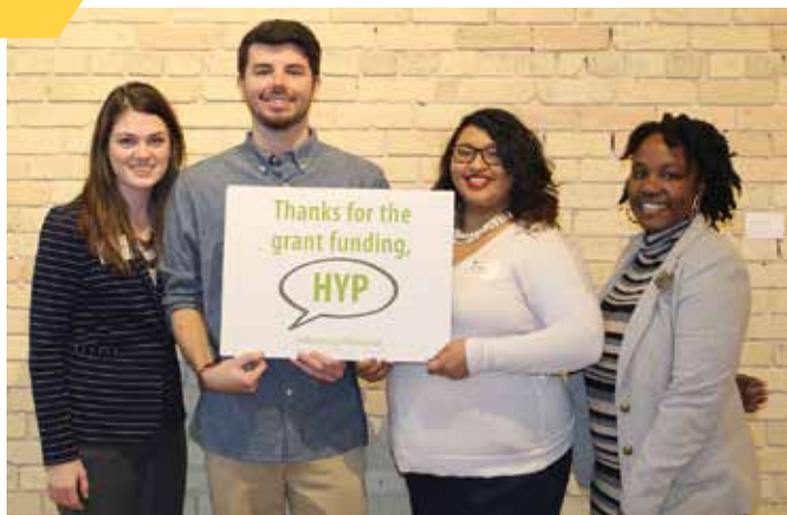
The Chamber and non-profits make Community Connections.