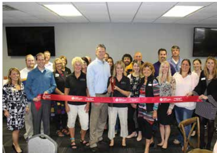
Our West Coast Chamber Ambassadors welcoming Gezelligheid with a ribbon cutting.