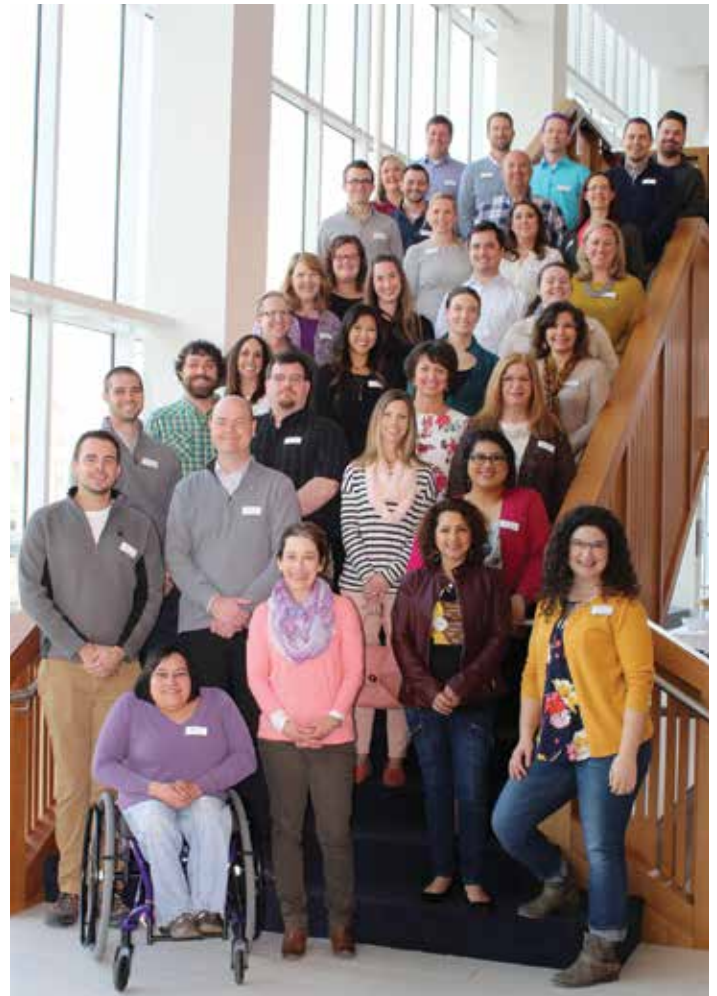
West Coast Leadership Class of 2018

The group project will take shape over the summer, and wrap up in the fall, when the theatre presents its first show of the 2018-2019 season. Ultimately, we hope this boost with help raise profile of the organization and encourage more people to engage with the theatre. From actors, to back stage crew, to ushers, donors and, of course, patrons, there are many opportunities, and the Leadership Class of 2018 is ready to help people connect.