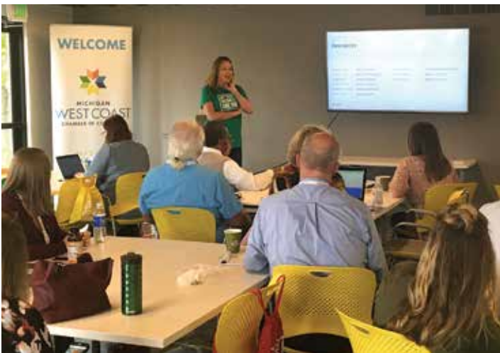
The Get Found on Google event was a hit!