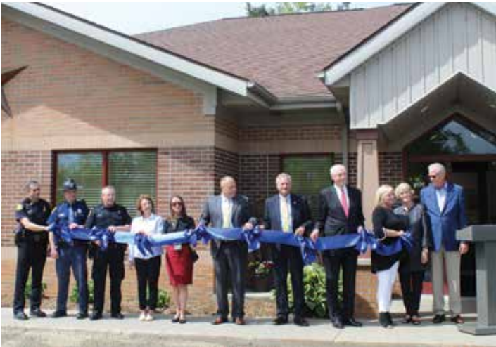
A fantastic ribbon tying for the opening of the Children's Advocacy Center.