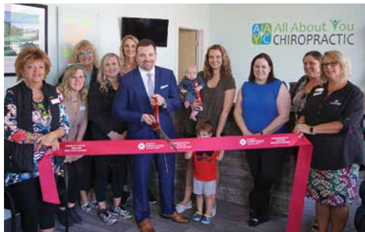
Even the kids helped out with this ribbon cutting at All About You Chiropractic.