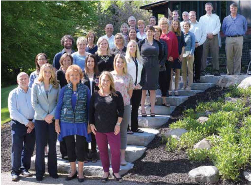
Your West Coast Chamber Ambassadors.

Keep reading to learn more about the 2018 Ambassador award winners.