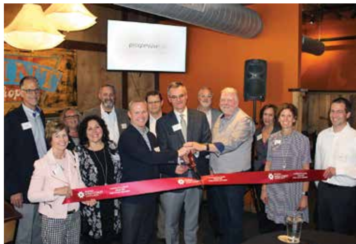
A wonderful ribbon cutting to celebrate Progressive AE.