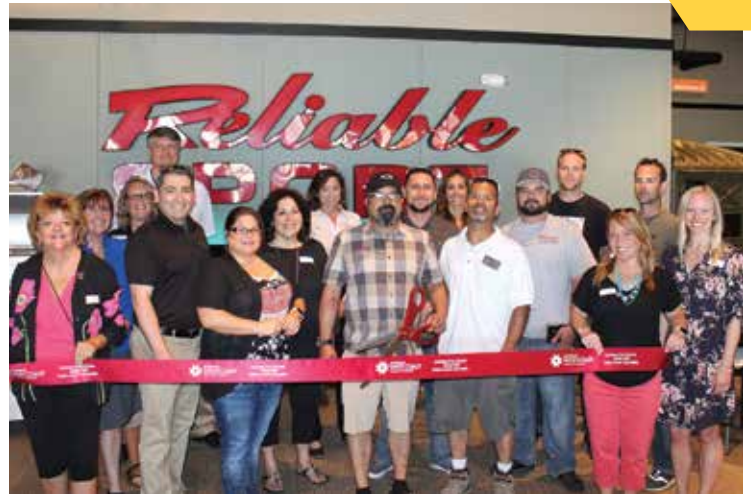
Celebrating the opening of Reliable Sport's new location.