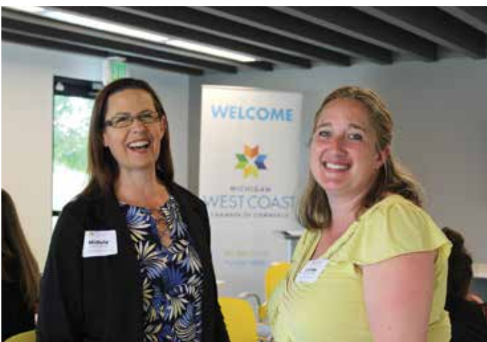
Community project kick off with our West Coast Leadership Alumni Affinity Group