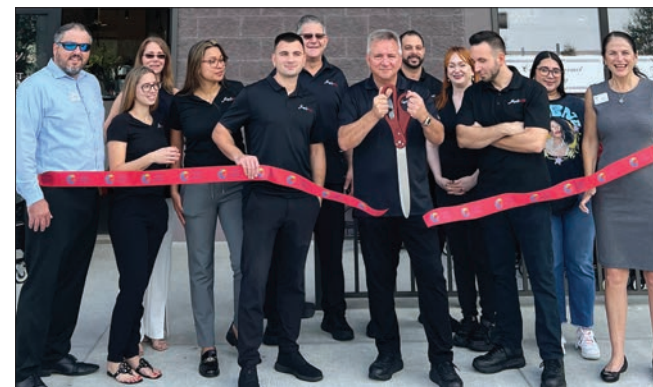
Joseph's Classic Market Nov. 22, 2022 4409 Northlake Blvd. Palm Beach Gardens, FL 33410