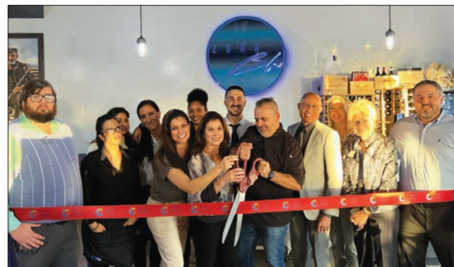
Zona Blu WPB Nov. 17, 2022 8170 Okeechobee Blvd., 1&2 West Palm Beach, FL 33411