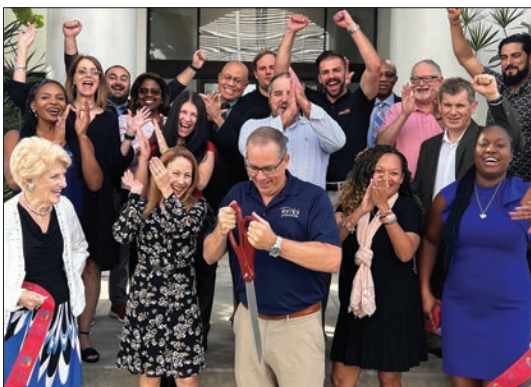
FEMBI Nov. 17, 2022 4440 PGA Blvd., Suite 600 Palm Beach Gardens, FL 33410