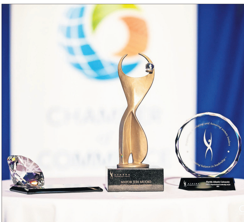
Athena Awards

We are now accepting nominations for the 29th Annual ATHENA Leadership Awards Luncheon. The ATHENA Leadership Award is presented to a woman – or man – who is honored for professional excellence, community service, and for actively assisting women in their attainment of professional excellence and leadership skills.