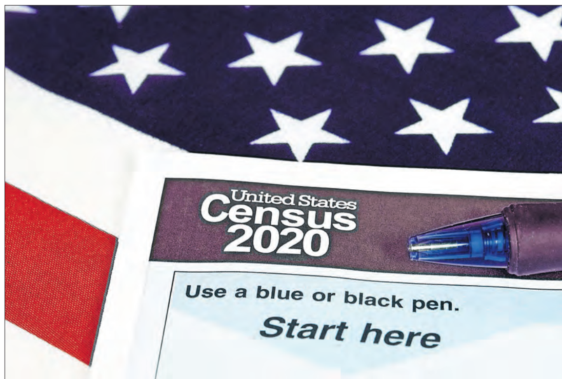
Kelly Smallridge