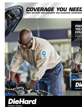
Countertop Display and Brochures