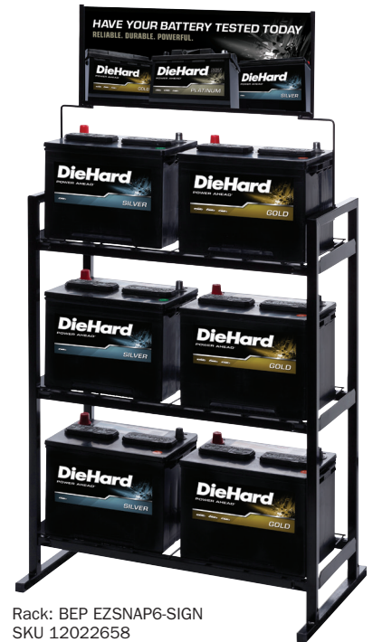
Rack: BEP EZSNAP6-SIGN SKU 12022658 Rack and Rack Topper

Plus, protect your customers with industry-leading battery coverage.