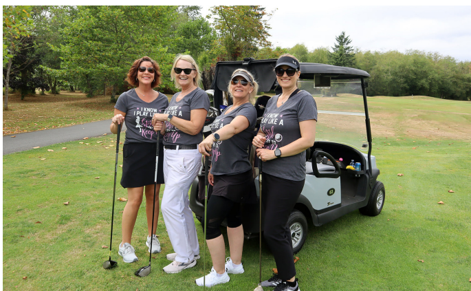
Battle of the Bridge Golf Tournament