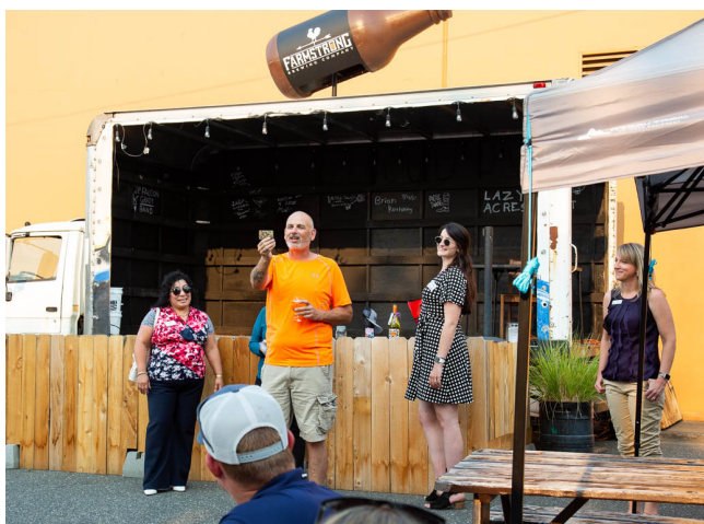
Multi-Chamber After Hours at Farmstrong Brewing