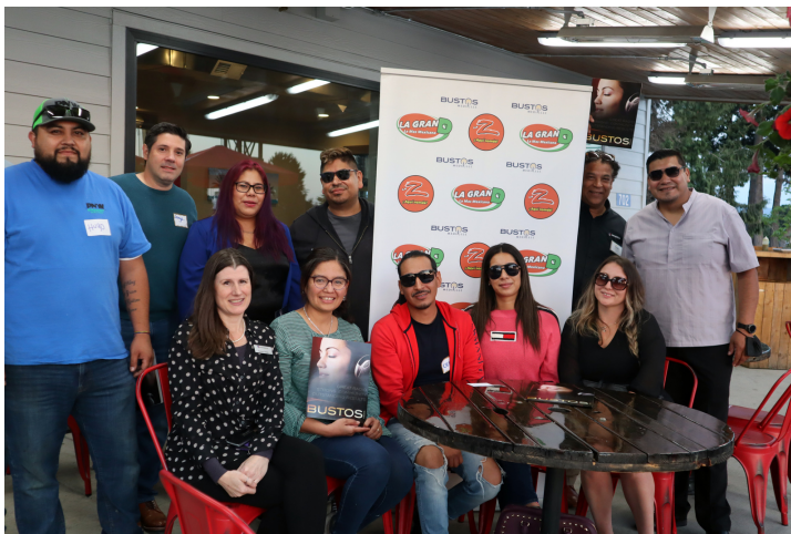
Latino Business Leaders Meet & Greet