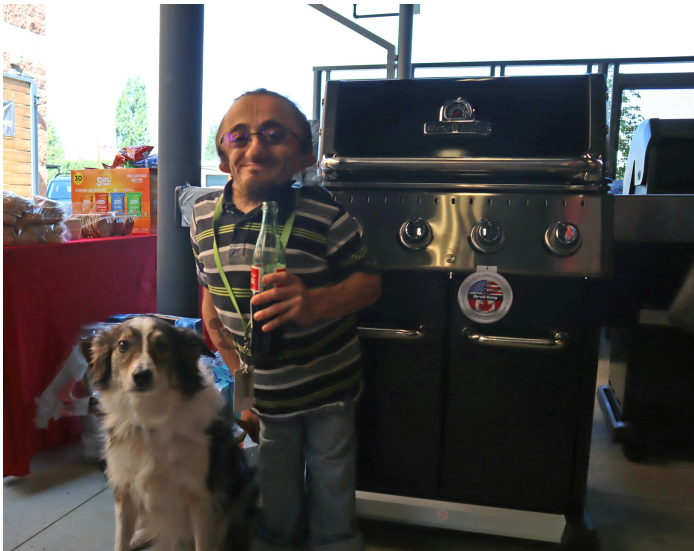
Member Appreciation luncheon at Craft Stove