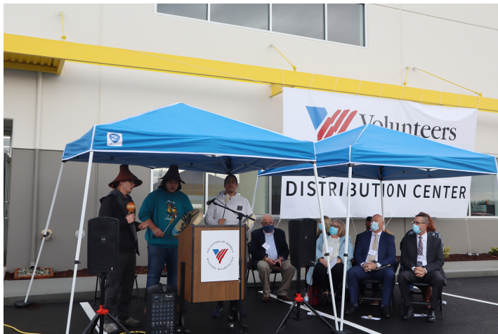
Opening ceremony celebrating Volunteers of America Western Washington's new 60,000+ square-foot regional Arlington Food Distribution Center.