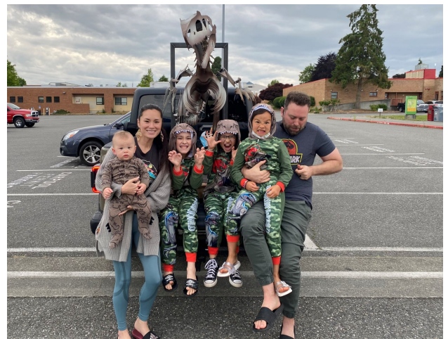
Drive-in Movie Night at Skagit Valley College