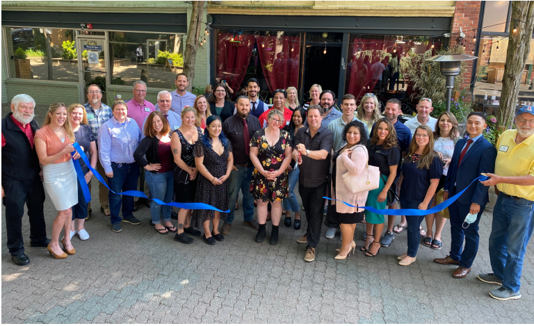
Revival Lounge Ribbon Cutting