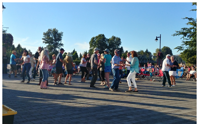
Riverwalk Summer Concert Series