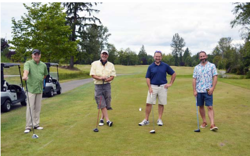
Battle of the Bridge Golf Tournament