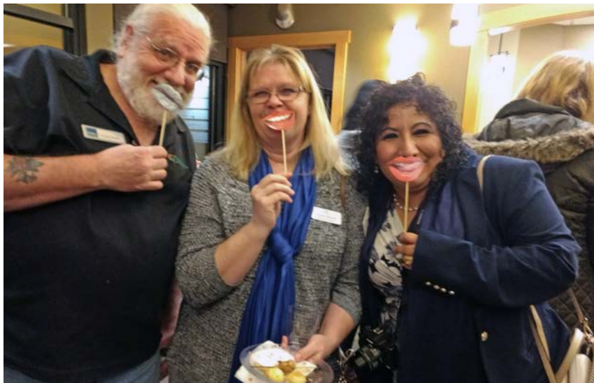
Multi-Chamber After Hours