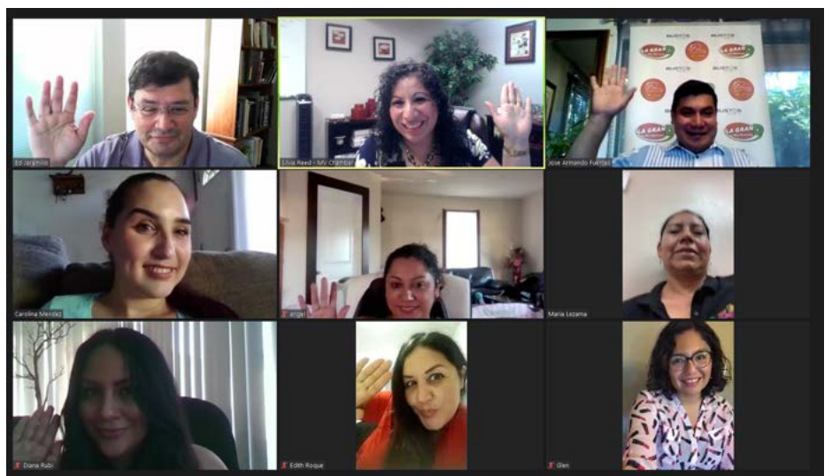
Left: Downtown Festival of Trees