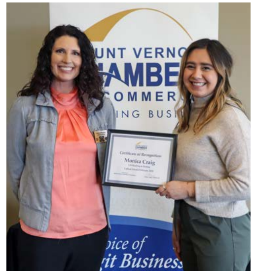
Upbeat Award, Chamber luncheon