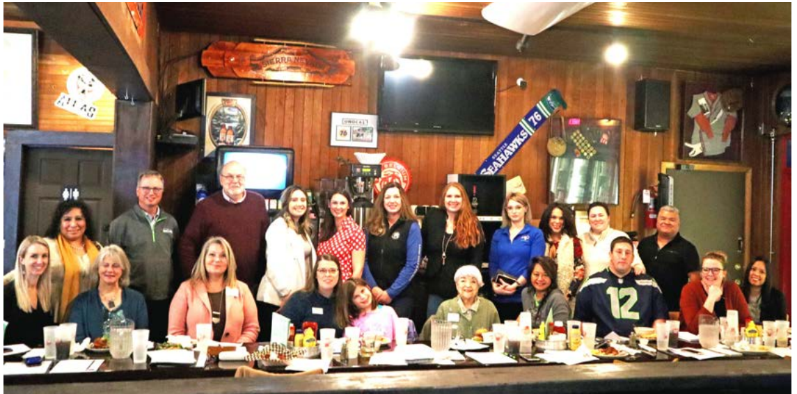
Chamber Ambassador Lunch

2020 will be a year to remember, and while the year wasn't what we expected, we still have had many reasons to be thankful for our Chamber community.