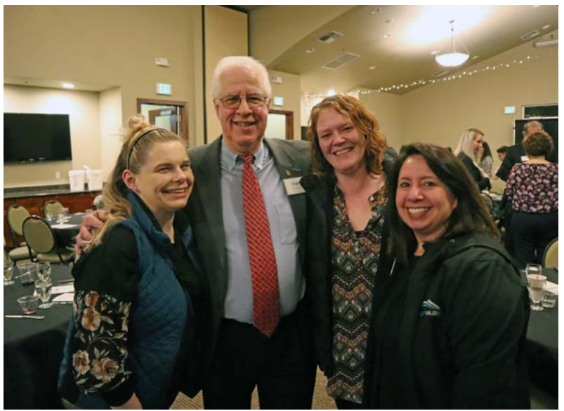
Chamber Awards Dinner