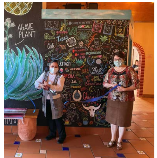
Ribbon cutting at COA