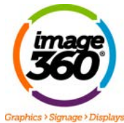
image360 produces and delivers expert graphic solutions for businesses and organizations. From small projects to the largest and most diverse, we help you maximize your visual impact.