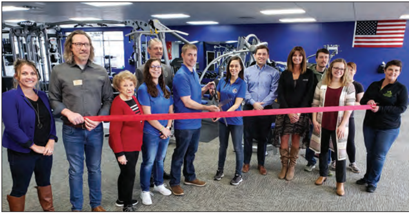
The community gathered on Friday, March 6 to celebrate the grand opening of Eagle Fit 24/7 with Meridian township officials, MABA, residents, and the Lansing Regional Chamber of Commerce. Eagle Fit 24/7 was founded by a U.S. Army veteran couple and was created to inspire the local community to reach their fitness goals and live a healthy lifestyle. They are a local, small community gym and members have access 24 hours, 7 days a week to accommodate any schedule. Eagle Fit 24/7 offers top of the line exercise equipment to be able to do any workout, including functional fitness training. Eagle Fit is the perfect place to be the second home for its members. For staffed hours and more information, visit www.eaglefit247.com and find them on Facebook at Eagle Fit Okemos.