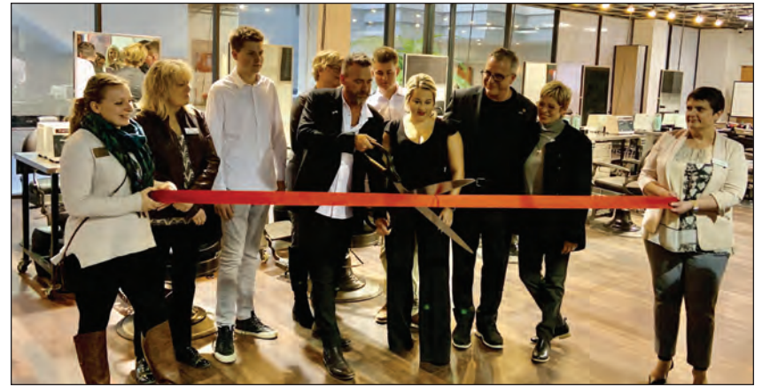
On March 4, Douglas J announced the opening of its School of Barbering, the first barbering program to come to greater Lansing that will be accredited. Located in the downtown East Lansing Marriott, the school will provide a yearlong, 1,800-hour curriculum in skills including precision cutting and shaving, color and chemical treatments, skincare and business management. The program will feature hands-on curriculum, similar to Douglas J's Aveda Institute where students provide services to clients while they learn. After earning a barber's license, students have multiple career tracks to choose from including becoming a barber, men's stylist or platform artist.

Our big scissors have been busy welcoming new businesses to the Lansing region, recognizing momentous milestones and celebrating growth and expansions! Having the Chamber host a ribbon cutting for your company is a great opportunity to build public awareness about your business and the growth or changes that you are experiencing. The Chamber's ribbon-cutting and groundbreaking services should be an important part of your overall marketing and advertising plan. We provide the camera, red ribbon, and of course, the big scissors!