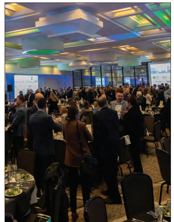
A sold out crowd of nearly 700 filled the large ballroom at the Kellogg Hotel