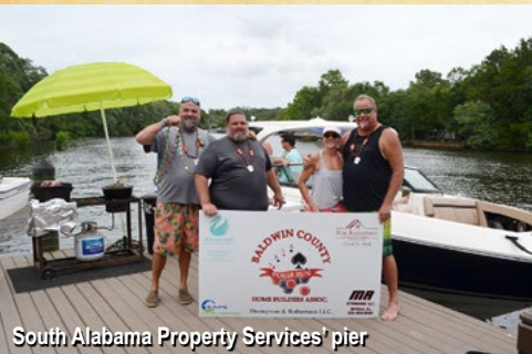
South Alabama Property Services' pier