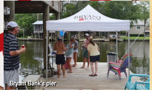
Bryant Bank's pier