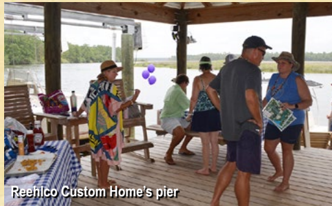
Reehco Custom Home's pier