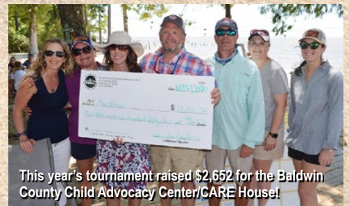
This year's tournament raised $2,652 for the Baldwin County Child Advocacy Center/CARE House!