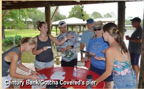
Century Bank/Gotcha Covered's pier