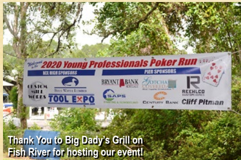
Thank You to Big Daddy's Grill on Fish River for hosting our event!