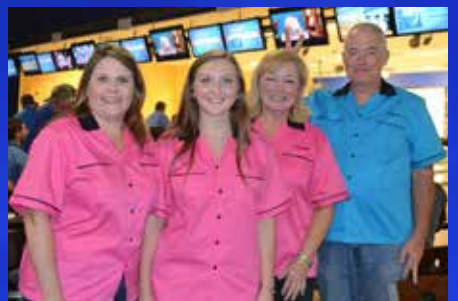
"Spare Me", the staff of BCHBA

For more pictures, check out our Facebook page!