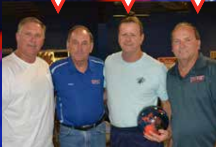
First Place Team, Knockout Pest Control