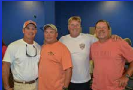
Interior Exterior's "Minds in the Gutter"