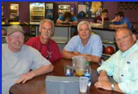
Alabama Roofing, "Scott's Ten Pin Nailers"