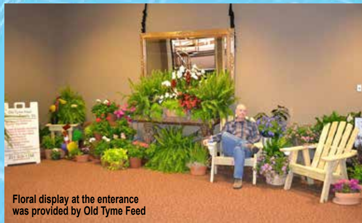
Floral display at the entrance was provided by Old Tyme Feed