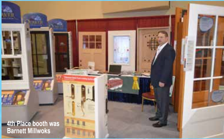
4th Place booth was Barnett Millworks