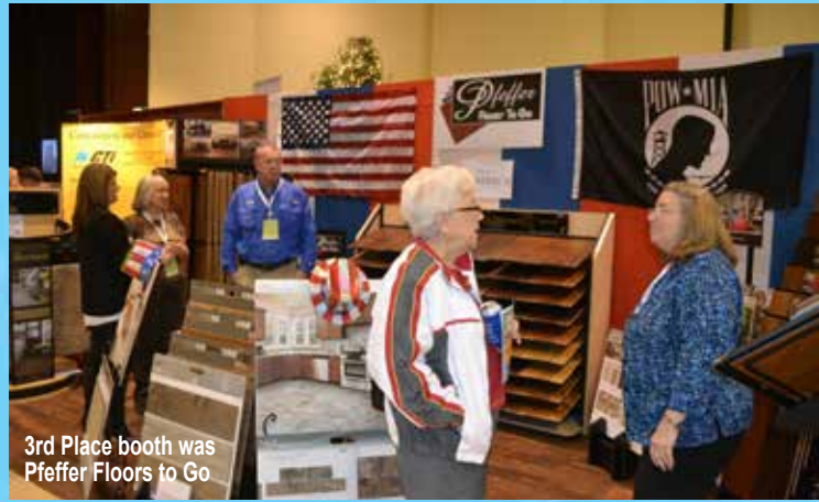
3rd Place booth was Pfeffer Floors to Go