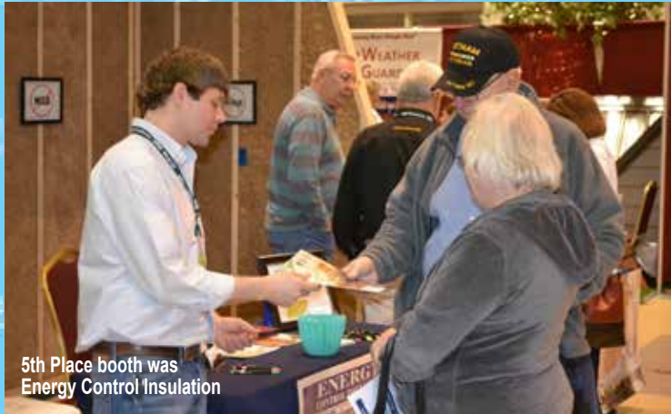
5th Place booth was Energy Control Insulation