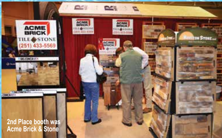
2nd Place booth was Acme Brick & Stone