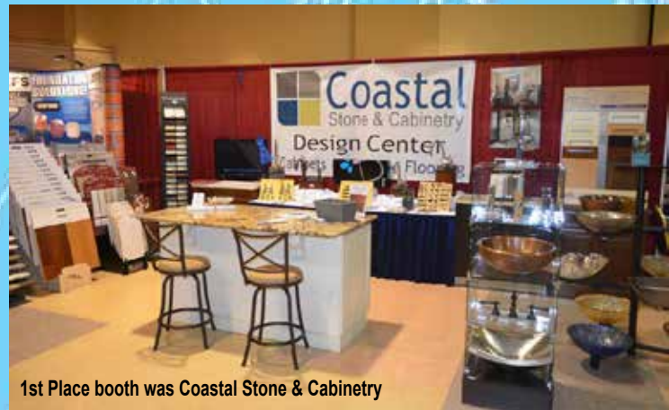
1st Place booth was Coastal Stone & Cabinetry