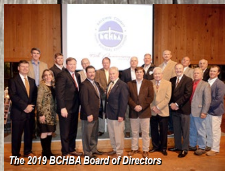
The 2019 BCHBA Board of Directors