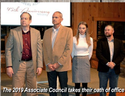
The 2019 Associate Council takes their oath of office