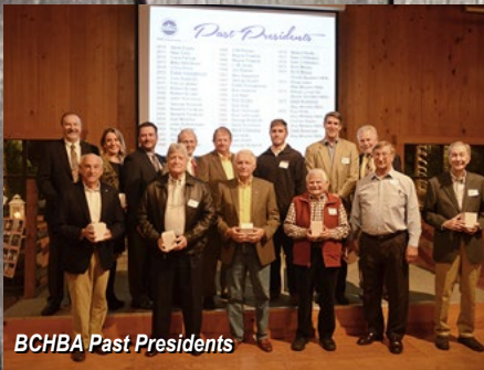
BCHBA Past Presidents