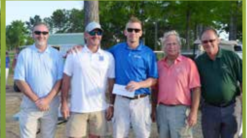
2nd place net - Backyard Paradise