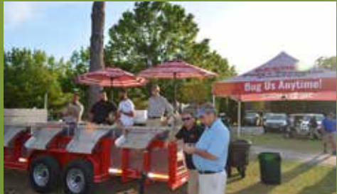
Thanks to Beebe's Pest & Termite Control for the awesome crawfish!