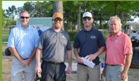
3rd place net - Point Clear Insurance