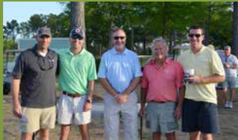
4th place net - Gulf State Ready Mix