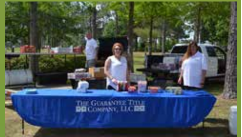
Thanks to The Guarantee Title for providing lunch!