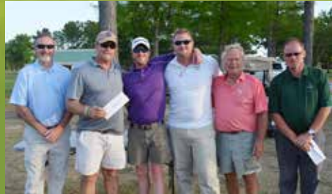
1st place net - D. R. Horton