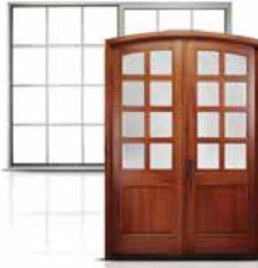
Windows, Doors, & Trim