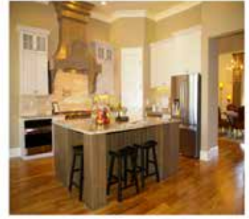
Cabinets & Appliances

SERIOUS BUILDERS, REMODELERS, AND CONTRACTORS KNOW WHAT THEY NEED. HERE'S WHERE THEY FIND IT.