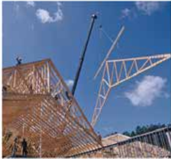
Roof & Floor Trusses