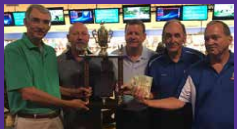
Marquee Custom Homebuilders BCHBA 2nd high score