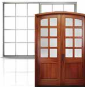
Windows, Doors, & Trim