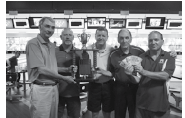
ON THE COVER Knockout Pest took the 1st Place High Score at the 2017 Battle of the Bay Bowling Tournament held in August at the Eastern Shore Lanes

Reserve your HBAA license plate and support trade education!