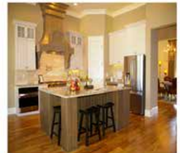
Cabinets & Appliances

SERIOUS BUILDERS, REMODELERS, AND CONTRACTORS KNOW WHAT THEY NEED. HERE'S WHERE THEY FIND IT.