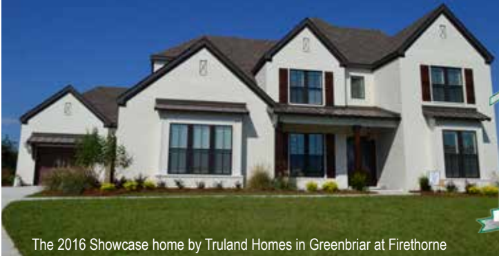
The 2016 Showcase home by Truland Homes in Greenbriar at Firethorne