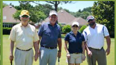
Coastal Stone and Cabinetry team