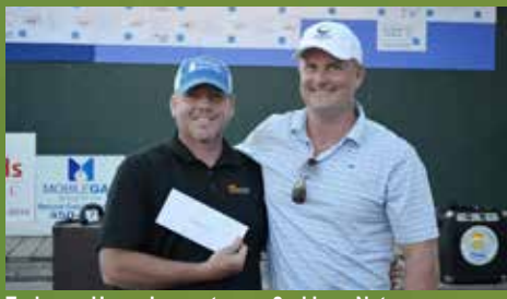
Embrace Home Loans team - 2nd Low Net