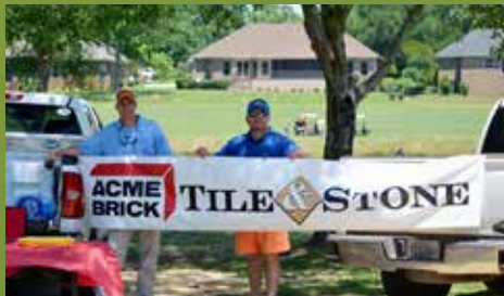
ACME BRICK TILE & STONE