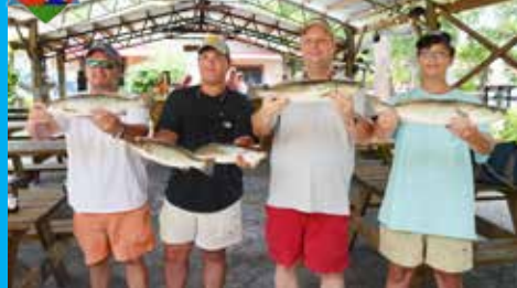
Bousson - Tindle team