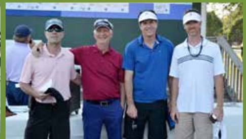
The SIF team in the money - 3rd Low Net!