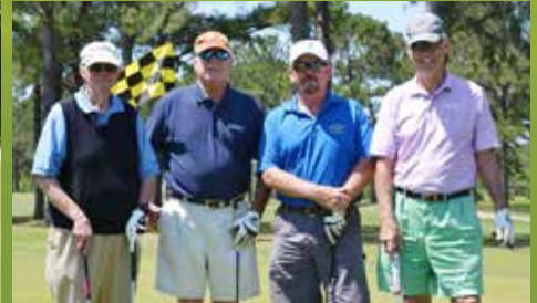
The Roberds team