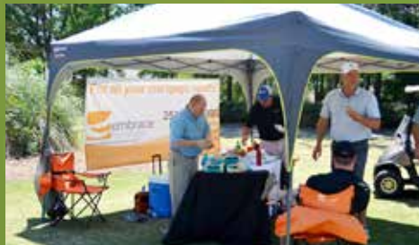
EMBRACE HOME LOANS