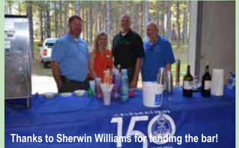
Thanks to Sherwin Williams for tending the bar!