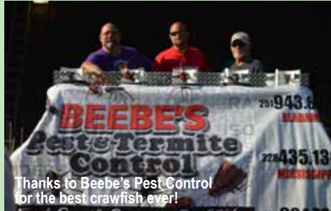
Thanks to Beebe's Pest Control for the best crawfish ever!