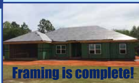
Framing is complete!

You may make donations to the Charitable Foundation at any time and earmark your donations to either the Home For A Hero or the Scholarship Program by calling (251) 928-9927