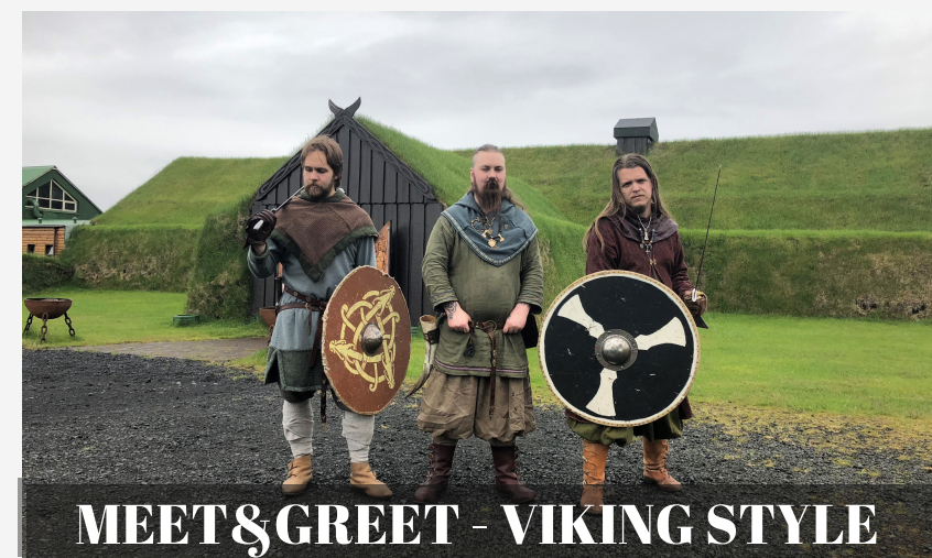
MEET & GREET - VIKING STYLE