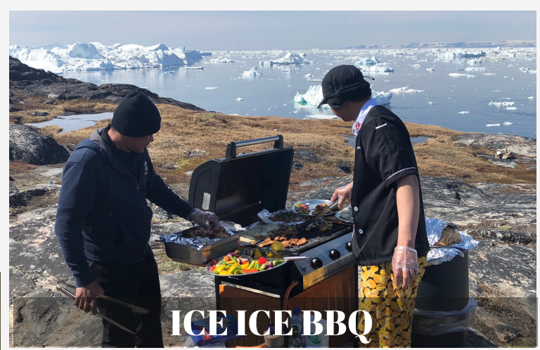
ICE ICE BBQ