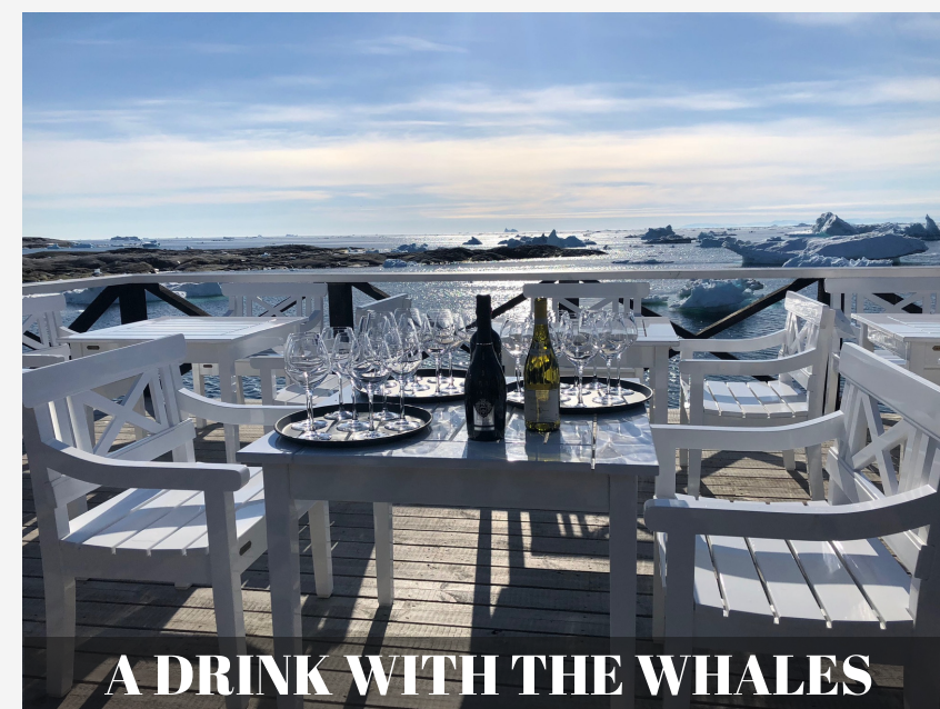
A DRINK WITH THE WHALES