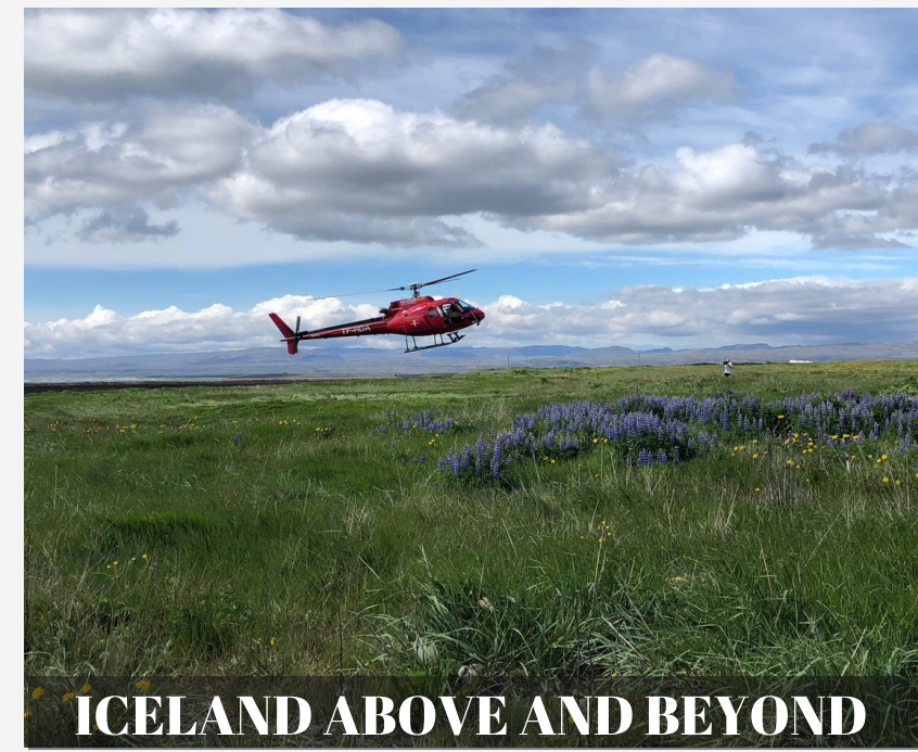
ICELAND ABOVE AND BEYOND

Hadler DMC was challenged to create an incentive for their top 9 achievers with an allure of intrigue and mystery that can't be overlooked. We created a program across three destinations – Denmark – Greenland and Iceland , that integrated the contrast of city, nature and serene community to create a one-of-a-kind incentive experience, showcasing the destinations' traditions and cultural beliefs through storytelling, authentic moments and relaxed atmosphere. The journey covered nearly 5000 km over 9 days and Hadler DMC managed to incorporate several cultural and authentic surprises for the guests and made this once-in-a-lifetime experience even better than they had imagined.