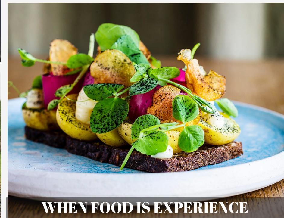
WHEN FOOD IS EXPERIENCE