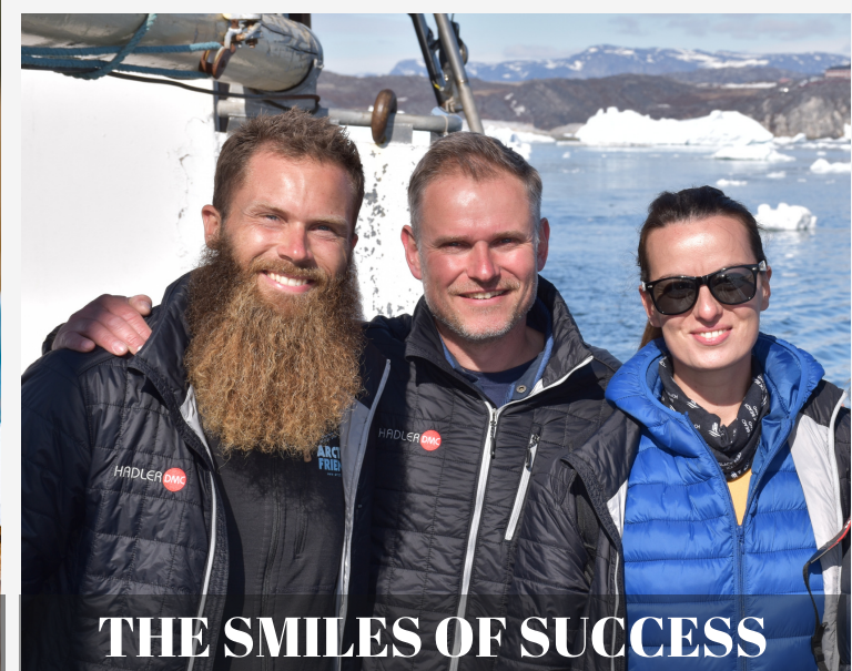
THE SMILES OF SUCCESS