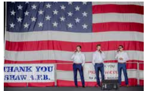
Military Appreciation Picnic

The Greater Sumter Chamber of Commerce is one of the oldest and most respected Chambers of Commerce in the state of South Carolina. We are a business leadership organization that is governed by a board of eleven directors and managed by six committed, professional staff members. The Greater Sumter Chamber of Commerce advocates for the prosperity of our business community on a local, state, and federal level. Our primary goal at the Greater Sumter Chamber of Commerce is to protect and communicate the best interests of our members and our business community.