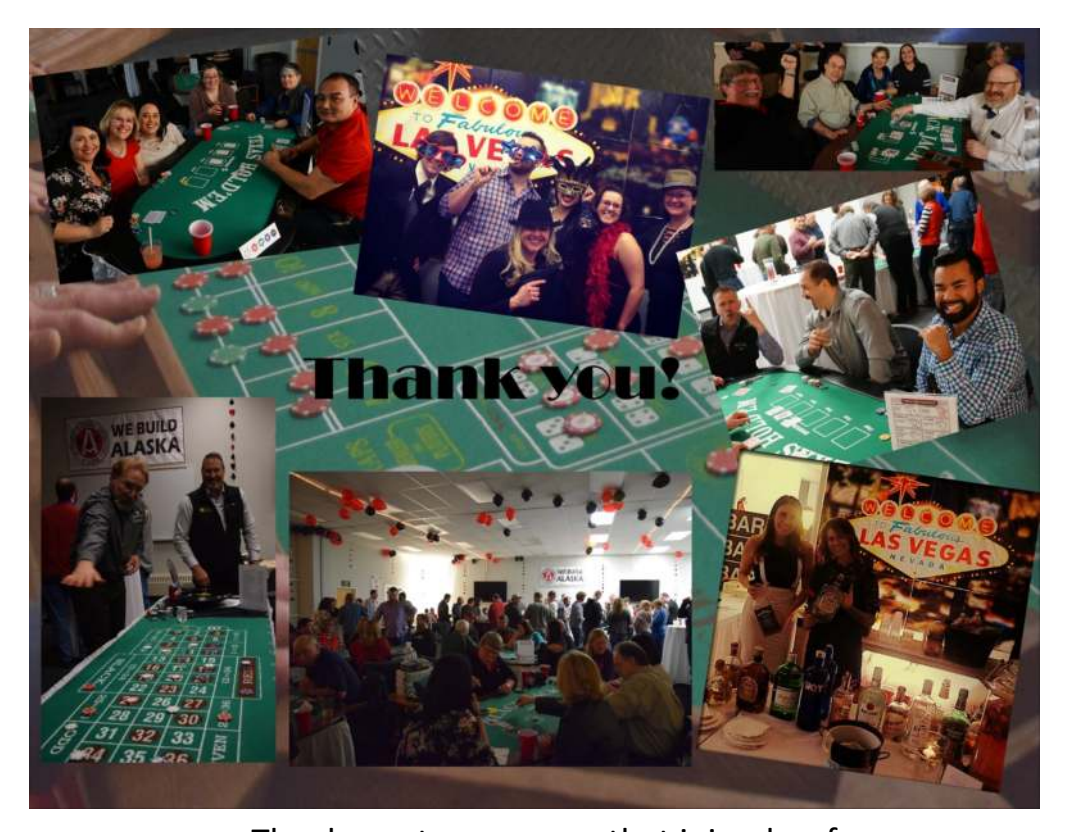
Thank you to everyone that joined us for AGC Fairbanks 1st Annual Casino Night Kick-off Party!

It was a wonderful evening with over 100 in attendance! Thank you to our Event Sponsor <a href="Chevrolet Buick GMC of Fairbanks">Chevrolet Buick GMC of Fairbanks</a>, to <a href="Denali Industrial Supply">Denali Industrial Supply</a> for donating their casino tables, all our amazing sponsors, dealers, volunteers, and <a href="Midnight Sun Catering">Midnight Sun Catering</a> for making this first year such a success! Click <a href="HERE">HERE</a> to see the photos & top three winners!