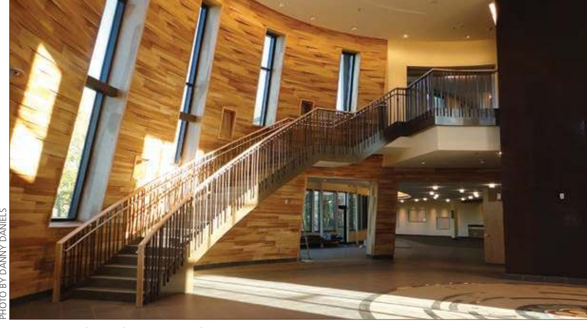
Tanana Chiefs Conference, Chief Andrew Isaac Health Care Center, Fairbanks, GHEMM Company

The Denali Commission—an innovative federal-state partnership Congress created in 1998 to more efficiently direct federal capital spending to rural infrastructure needs—continues to decline in importance. Most of its modest capital budget will be for energy-related projects.