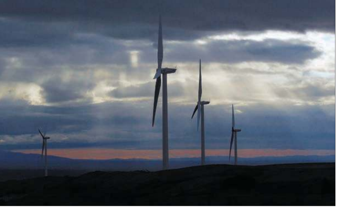
Eva Creek Wind Farm, Brice Inc.

Brooks Range Petroleum is working to develop the Mustang field, west of Kuparuk, with financial assistance from the Alaska Industrial Development and Export Authority (AIDEA).