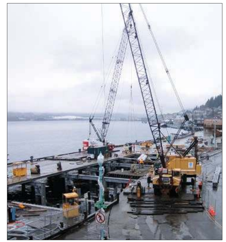
Ketchikan Berth I and II Rehabilitation, Orion Marine Contractors

The payrolls and profits from this construction activity support businesses in every community in the state. As this income is spent and circulates through local economies, it generates jobs in businesses as diverse as restaurants, dentists' offices, and furniture stores.