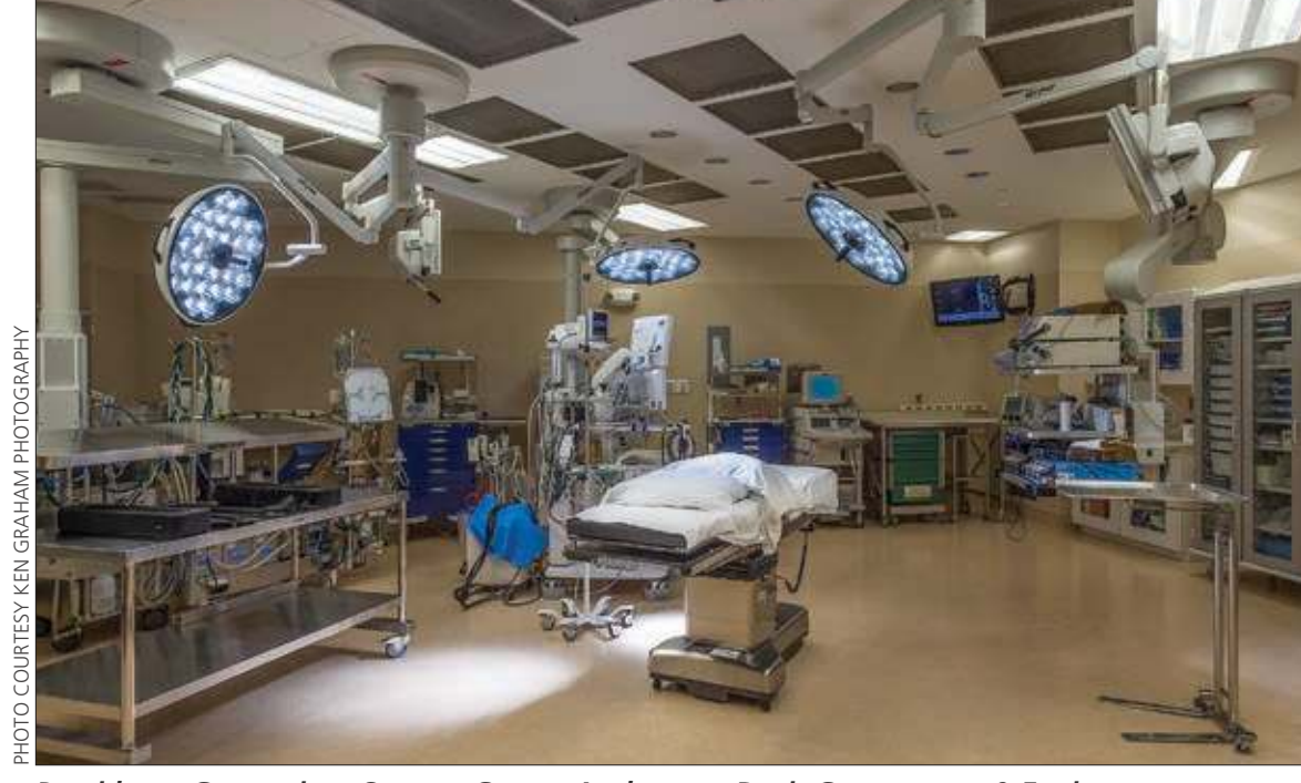
Providence Generations Surgery Center, Anchorage, Davis Constructors & Engineers

Hospitals around Alaska are continuously renovating and expanding. This year the largest planned project is at the Alaska Native Medical Center in Anchorage, where a state-financed residential housing facility for patients and their families is scheduled for construction, along with a new parking garage. Providence Hospital is