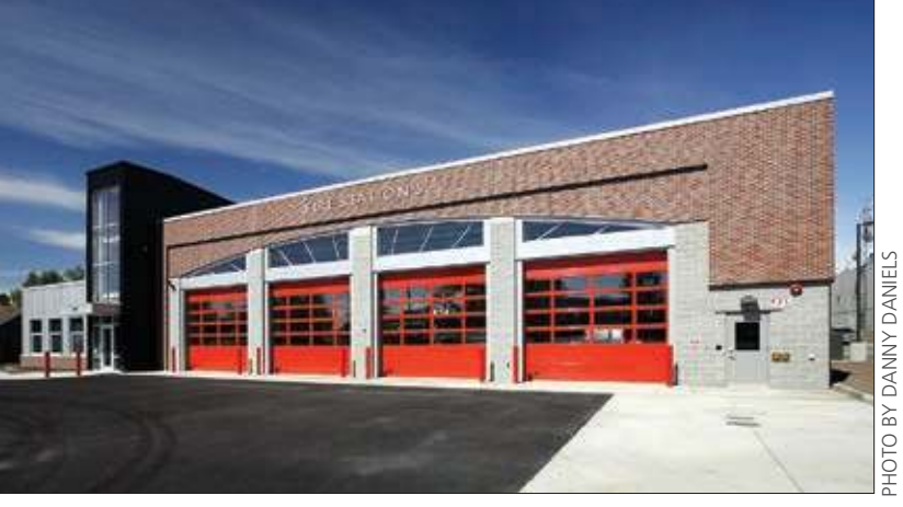
Municipality of Anchorage, Fire Station 5 Replacement, Roger Hickel Contracting

Most of the funding for the state- administered Village Safe Water program for rural sanitation comes from federal sources, including the Environmental Protection Agency and the Indian Health Service. With the state contribution, it is expected to be constant at about $60 million this year. Other types of federal grants fund armories and veterans' facilities and ferry terminals, among other things.