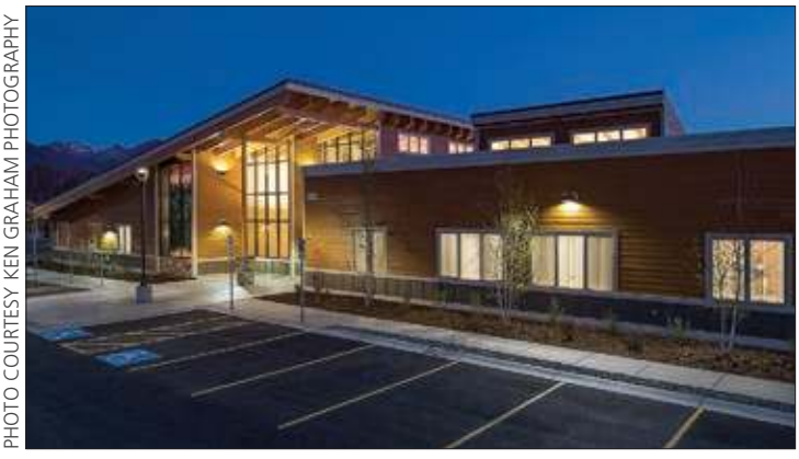
Providence Alaska Cottages, Anchorage, Davis Constructors and Engineers and Superior Plumbing and Heating

Telecommunications spending will also be higher this year, driven by new firms moving into the market (Verizon), as