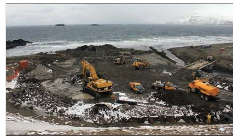
Akutan Airport, Kiewit Infrastructure West

<sup>11</sup> It is difficult to track all the federal dollars that find their way into construction spending in the state, because there are so many pathways, and they change every year. The possibility of double counting funds as they pass from agency to agency, or become part of a larger project, also creates difficulties for the analyst.