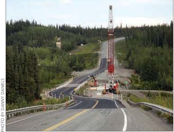
Tolsona River Bridge (Glenn Highway), Mowat Construction

Defense spending, which had been falling and was projected to continue to shrink as the federal budget tightens, will take a