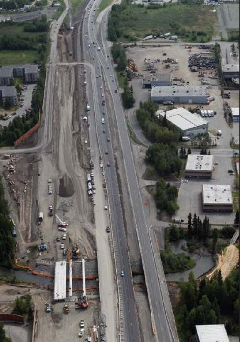
Seward Highway Reconstruction, Anchorage, QAP

big jump this year. The budget for MILCON (military spending for facilities on bases), which was only $33 million last year, is forecast to be $103 million. Funding includes seven new projects at Fort Wainwright, of which the largest is a $36 million warm-storage hangar. The environmental program budget, including FUDS (Formerly Used Defense Sites), will also be larger, at $127 million in 2014. This program includes cleanup of hazardous substances and contaminants at former defense sites as well as on current Army and Air Force installations.