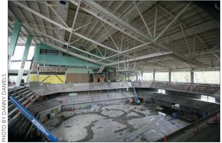
UAA Sports Complex (Alaska Airlines Center), Anchorage, Cornerstone General Contractors

Also on the North Slope, ENI is continuing to drill wells in the Nikaitchuq field, and Savant is re-working wells at Badami. Pioneer has plans to expand its facilities at the Oooguruk field, with an additional onshore production pad and expanded island.<sup>6</sup>