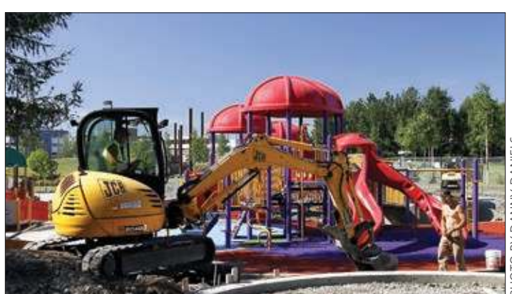
Cuddy Park Playground, Anchorage, JTA Construction