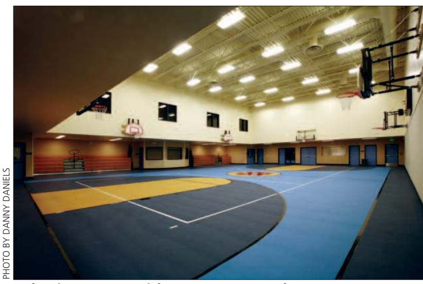
Salvation Army Enrichment Center, Anchorage

<sup>11</sup> It is difficult to track all the federal dollars that find their way into construction spending in the state, because there are so many pathways, and they change every year. The possibility of double counting funds as they pass from agency to agency, or become part of a larger project, also creates difficulties for the analyst.