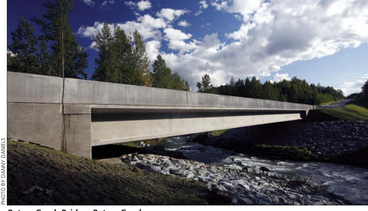
Peters Creek Bridge, Peters Creek

None of the three major producers on the North Slope—British Petroleum (BP), Conoco Phillips, and Exxon—will be exploring, and all are anticipating less spending this year than in 2011. BP will concentrate on sustaining production of light oil in existing reserves, maintaining aging infrastructure, and developing heavy oil. Conoco Phillips and Exxon will also concentrate on developing existing reserves. Work at Alpine, Point Thomson, and Liberty is not currently scheduled for this year.