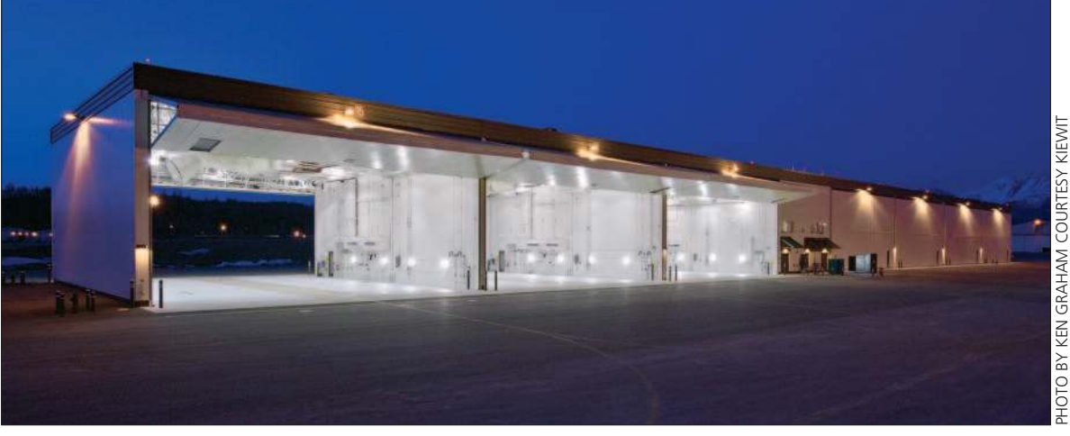
F-22A Bay Aircraft Shelter, Joint Base Elmendorf–Richardson

As with highway spending, the increase in airport, port, and harbor spending this year is due to the increase in grants in the state capital budget for transportation infrastructure. Significant grants went to airports, including a number of projects at Ted Stevens Anchorage International Airport for taxiway reconstruction, storm water treatment facilities, residential sound insulation, and other improvements. Funds were granted to the Anchorage and Point MacKenzie ports for a small part of the costs of their expansion (although the Anchorage port has announced it will temporarily stop work on expansion plans). Other ports and harbors around the state also benefited from Department of Commerce grants in the state capital budget. Another smaller source of funding for ports is the cruise ship tax, and a number of small projects have been authorized with funding from that source.