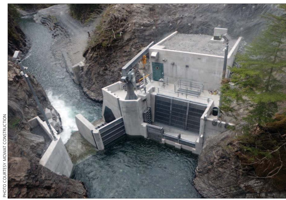
Humpback Creek Intake Diversion Rehab, Prince William Sound

<sup>6</sup> Although we include utilities and health spending in private spending, there is also a significant amount of public spending for some projects in these categories.