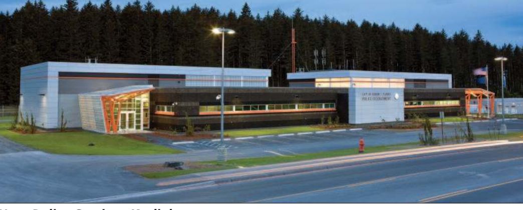
New Police Station, Kodiak

The absence of large projects reflects both the adequacy of the existing stock of retail, commercial, and warehouse space in most communities due to growth in prior years—as well as uncertainty about the future of the petroleum industry in the state.