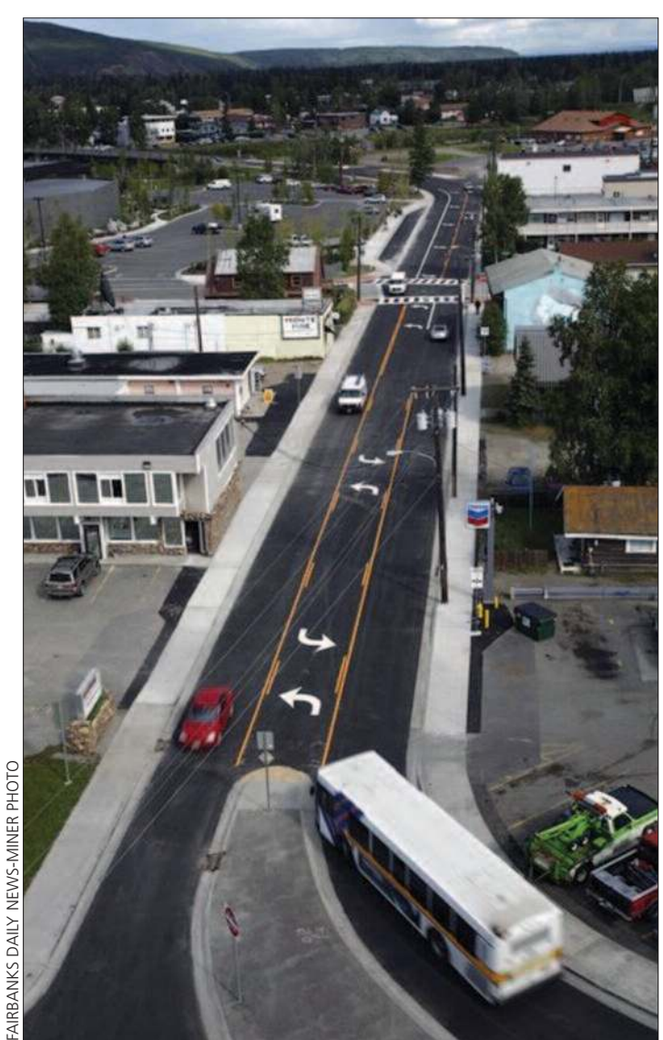
Wendell Avenue Improvements, Fairbanks

Spending for airports, ports, and harbors will increase 21% over last year. As with highways the bulk of funding for airports generally comes from federal grants—in this case, through the Federal Aviation Administration's Airport Improvement Program (AIP). The level of funding this year from AIP grants is about the same as last year. Those grants fund airport projects throughout the state.